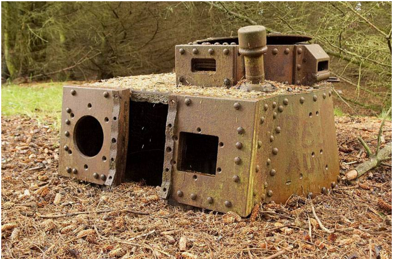
PzKpfw. 38(t) turret – Borhaug, near Vestbygd (Norway)

Ondrej Filip, August 2012 - http://zapisnik.fortif.net/opevneni-na-poloostrove-lista/