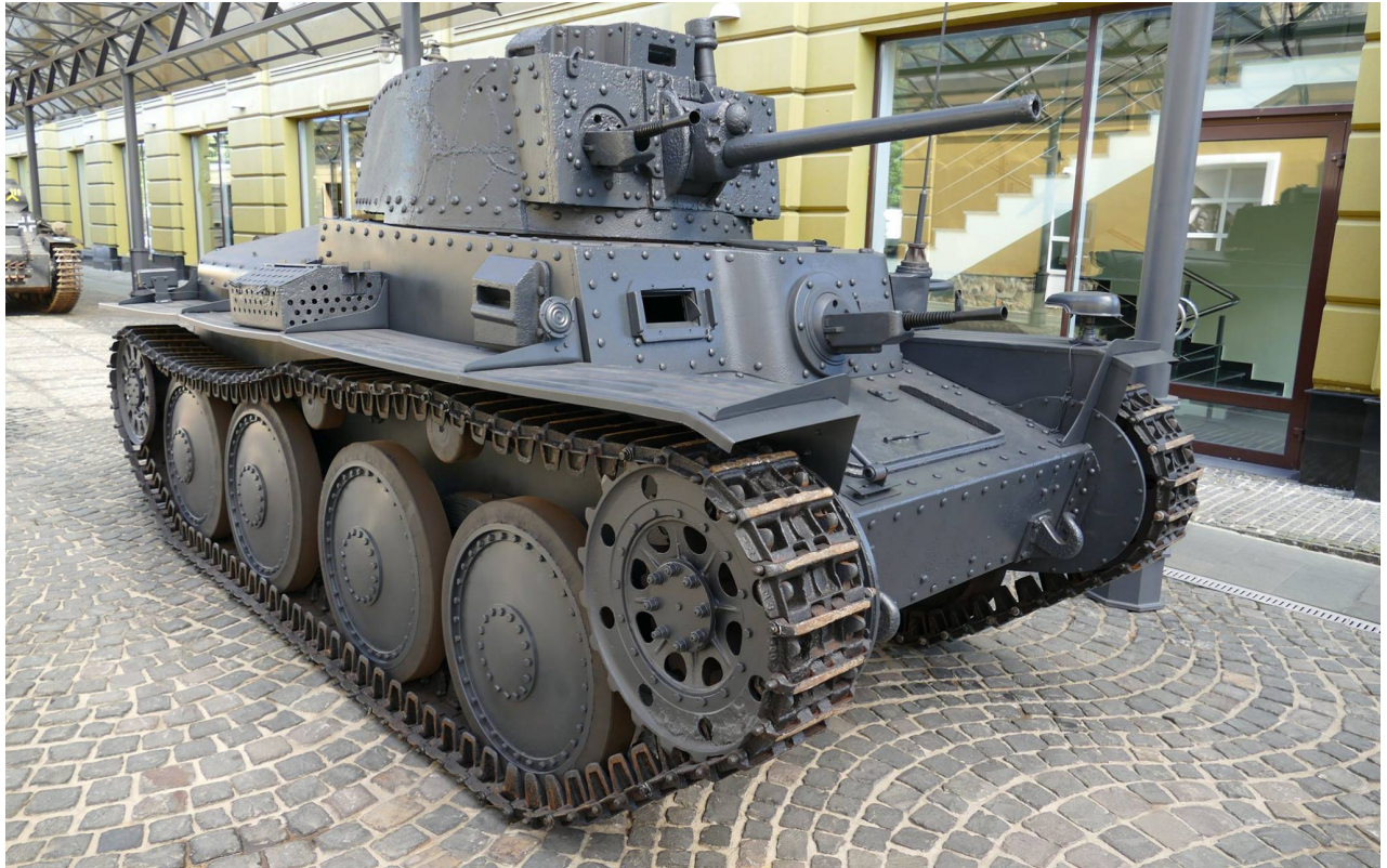
PzKpfw. 38 (t) – Patriot Park, Kubinka (Russia) Chassis Number 793