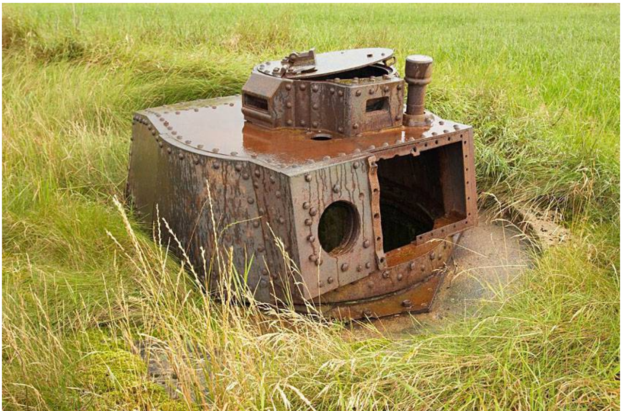
PzKpfw. 38(t) turret – Festung Lista, Wn Østhassel, Farsund (Norway)

Ondrej Filip, August 2012 - http://zapisnik.fortif.net/opevneni-na-poloostrove-lista/