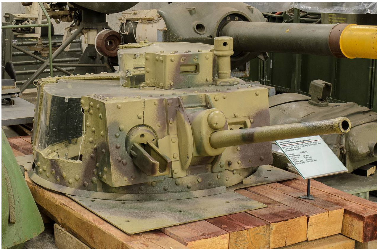
PzKpfw. 38(t) turret – Kevin Wheatcroft Collection (UK) Previously located on a Tobruk in Stavanger area (Norway)

"270862", July 2015 - https://www.flickr.com/photos/131561895@N06/20427495075/in/album-72157656907522941/