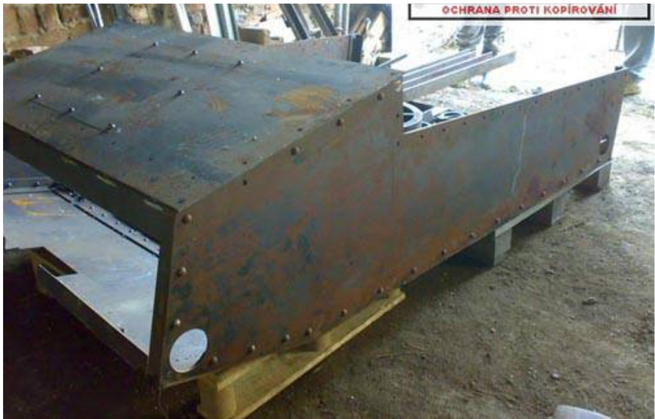
Tančík vz.33 (reproduction) – Private collection (Czech Republic) – running condition