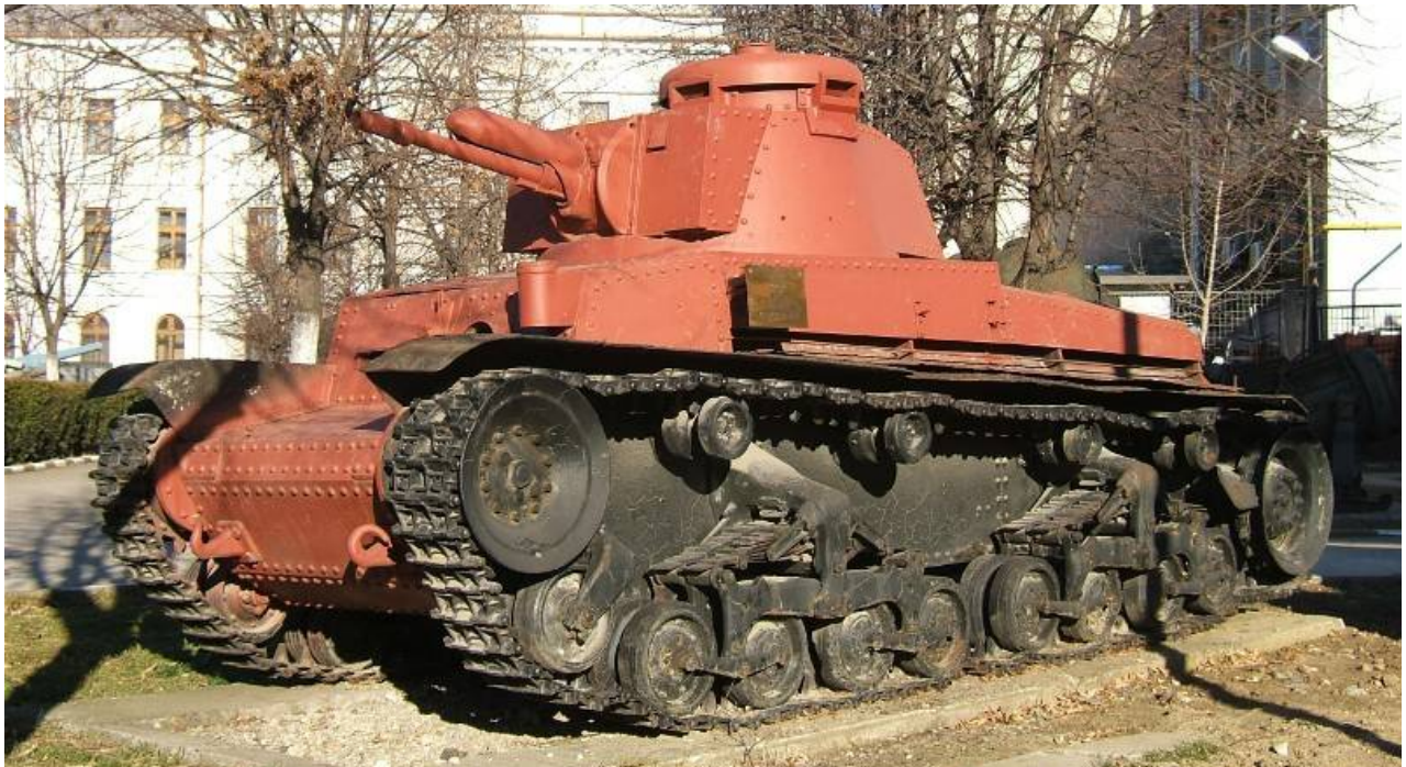
Doug Kibbey, January 2007 - http://www.com-central.net/index.php?name=Forums&file=viewtopic&t=5132&start=45

This tank was previously displayed at the Aberdeen Ord. Museum (USA), until mid-2008. It was restored at Lesany in 2010. Some new information was revealed thanks to "palic": the Serial Number is 10112, the tank was produced by CKD Prague. The original Czechoslovak military registration number was 13.962. The tank was delivered to the CZ Army in 1937, and after the German occupation this vehicle (minus its turret) continued its operational service in the WH as a Mörsezugmittel 35(t). After some unknown damages, this vehicle was sent to Skoda Pilsen to be repaired and remained there until the liberation of Czechoslovakia (it was not recovered from the Hillersleben Proving Ground, contrary to what the Aberdeen museum said). This vehicle was then equipped with a turret and repaired on request of the US HQ, and then shipped to the USA for tests of the pneumatic and steering system