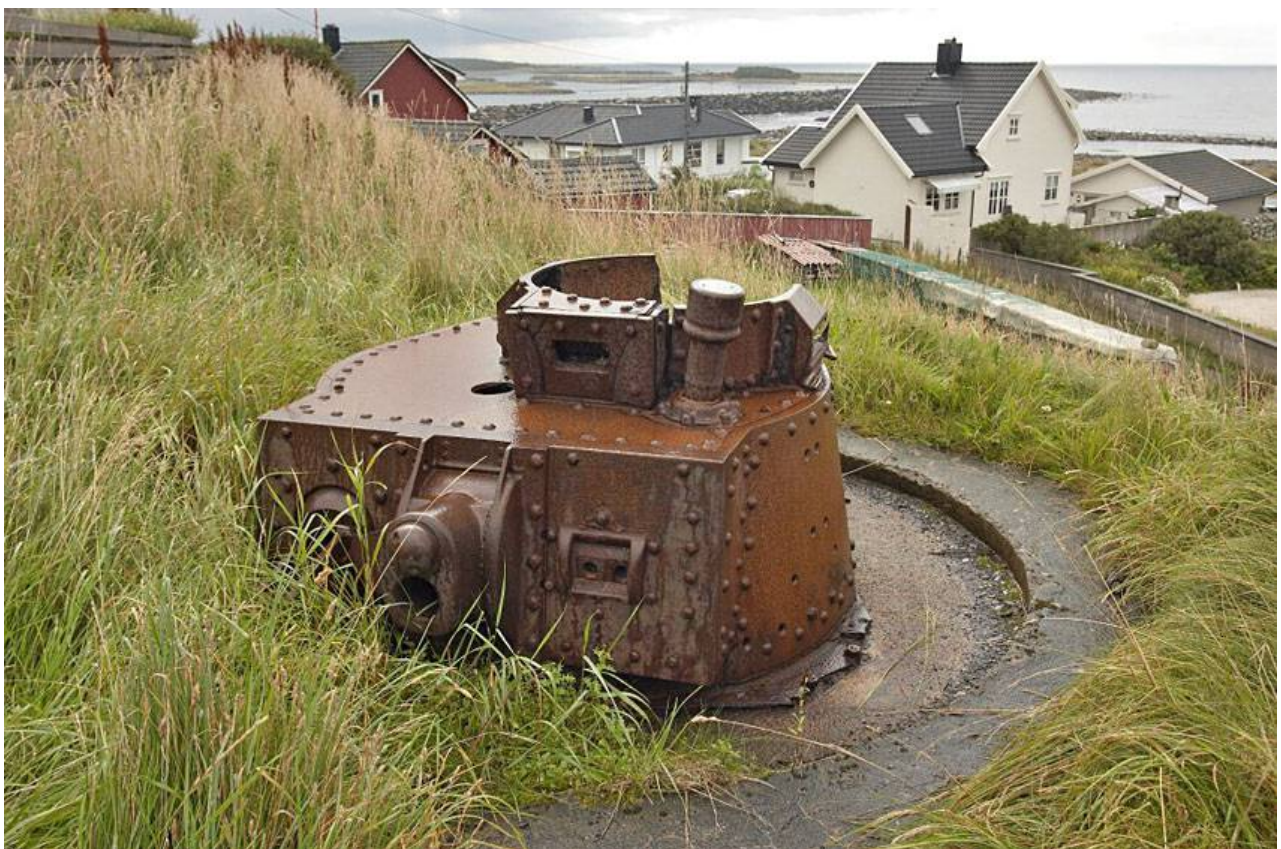
PzKpfw. 38(t) turret – Festung Lista, Wn Nordhassel, Farsund (Norway)

Ondrej Filip, August 2012 - http://zapisnik.fortif.net/opevneni-na-poloostrove-lista/