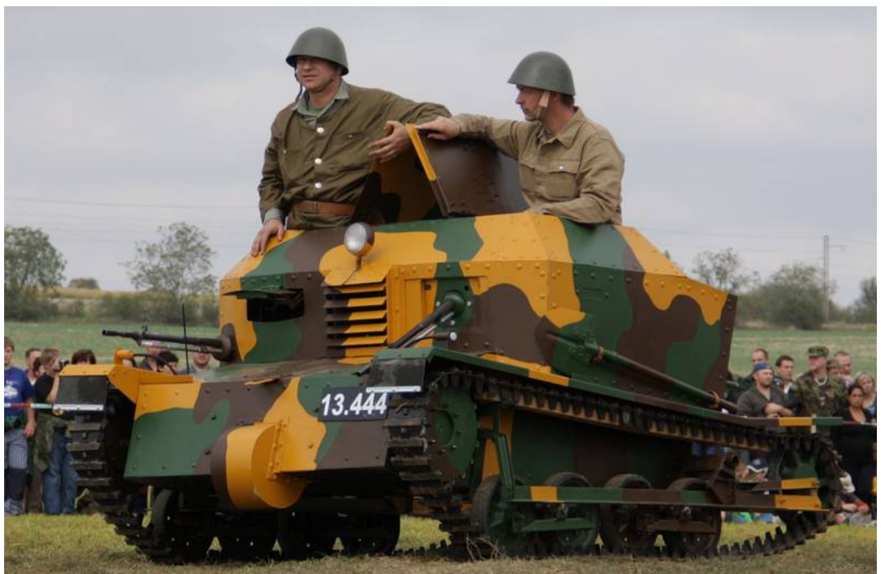
OA vz. 30 armoured car (reproduction) – Private collection (Slovak Republic)

http://www.tancik-vz33.estranky.cz/fotoalbum/utajena-pevnost-mj-s-4-chvalovice/2012-09-29_4990.html