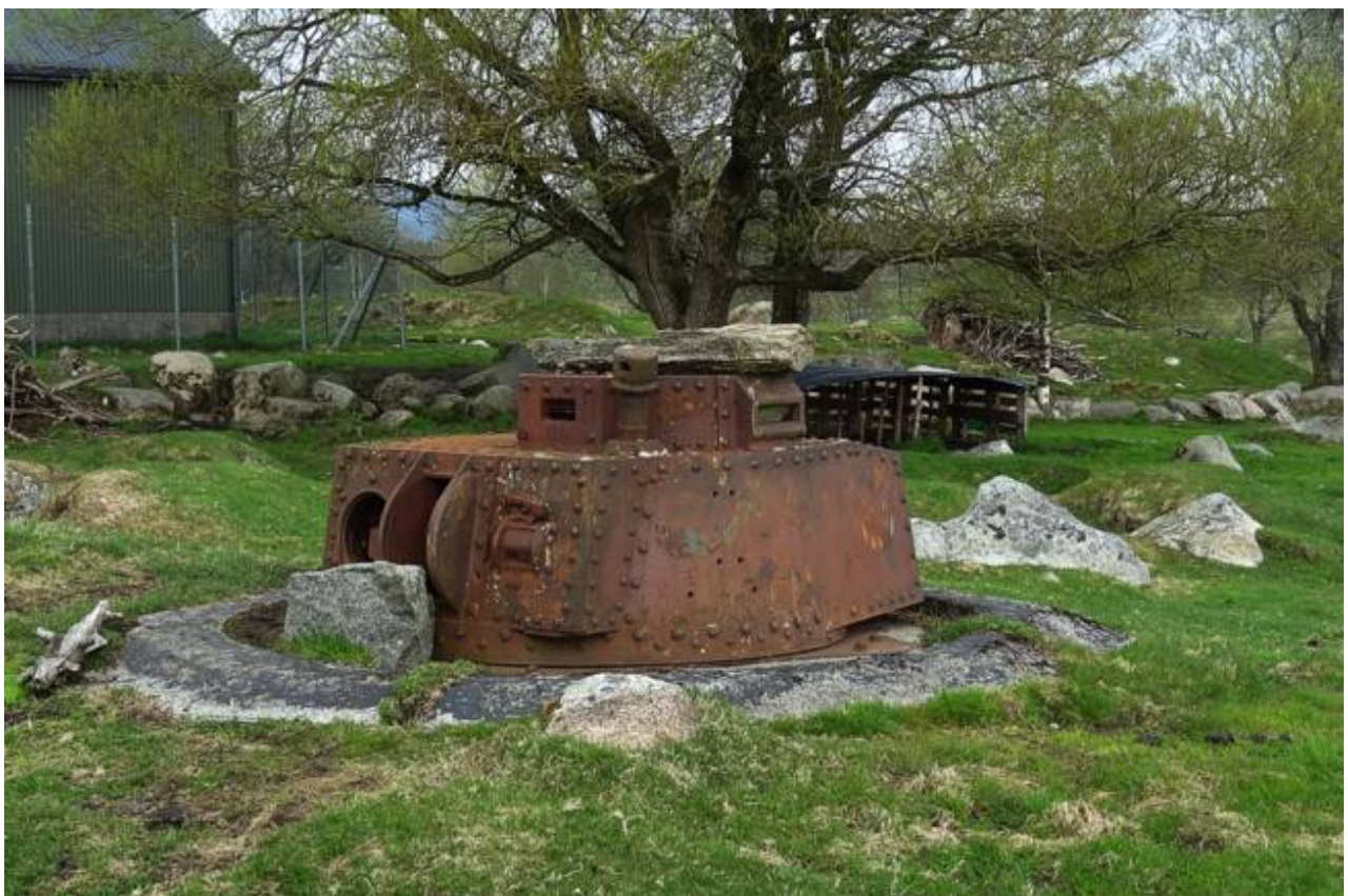
PzKpfw. 38(t) turret – Wn Sola Land III, near Stavanger (Norway)

http://bunkersite.com/locations/norway/rogaland/tk-sola-land5.php