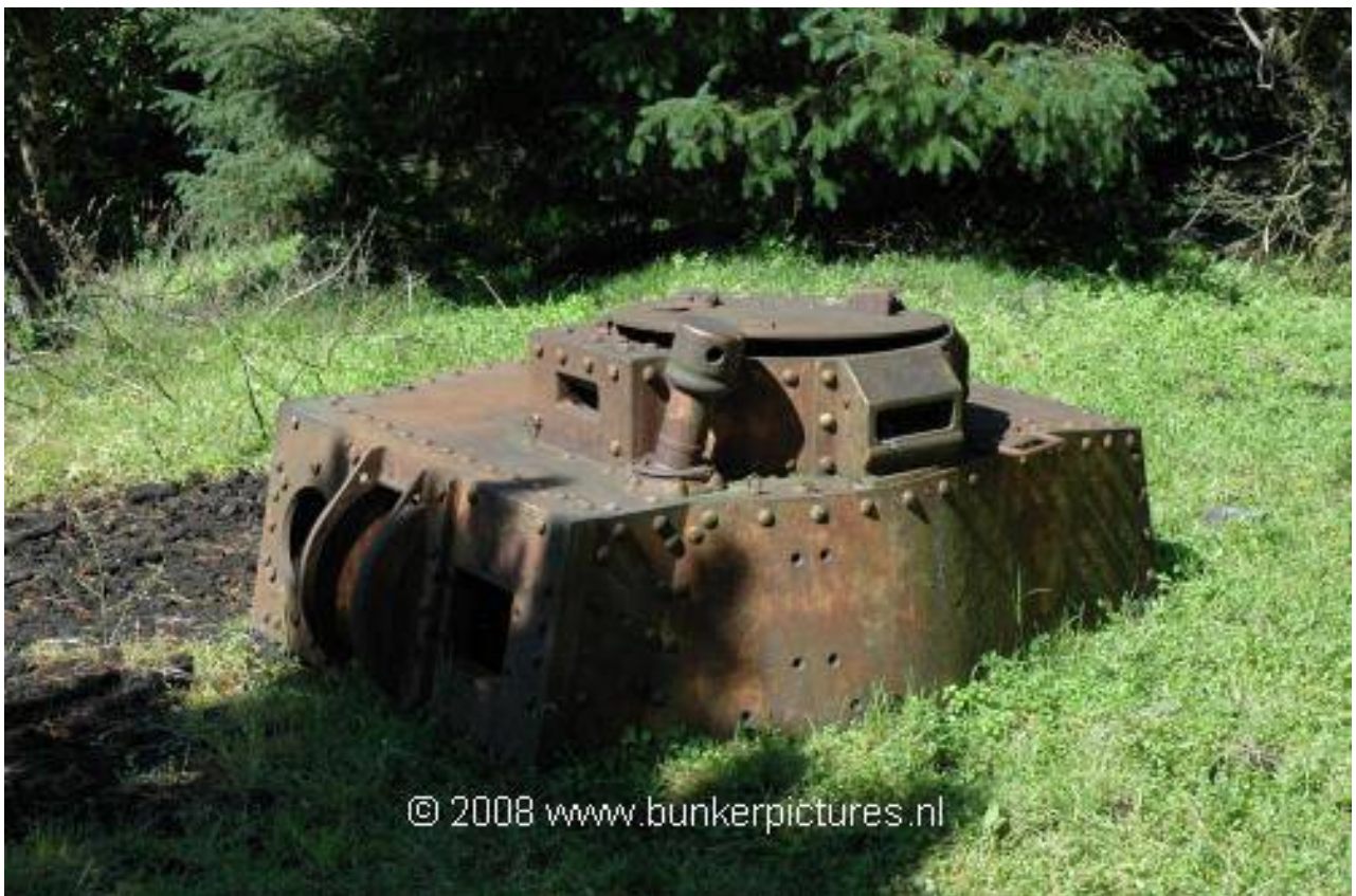
First PzKpfw. 38(t) turret – Inland defence line, Gossa Island, Møre og Romsdal (Norway)

http://www.bunkerpictures.nl/pictures/norway/more%20og%20romsdal/gossen/landfront/aanvang.html