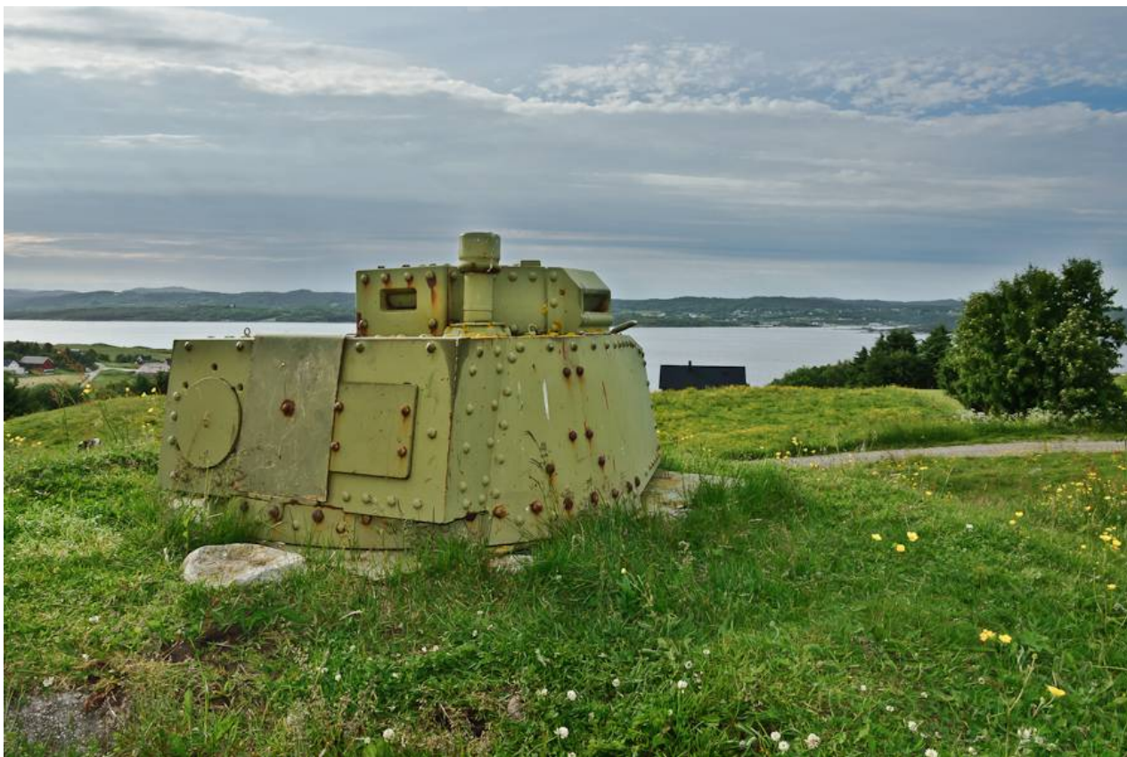
Two LT vz. 35 turrets – Batterie vara / Møvik fort, Augland, near Kristiansand (Norway)

http://www.flickr.com/photos/40870293@N04/4808086645/in/set-72157624554530686/