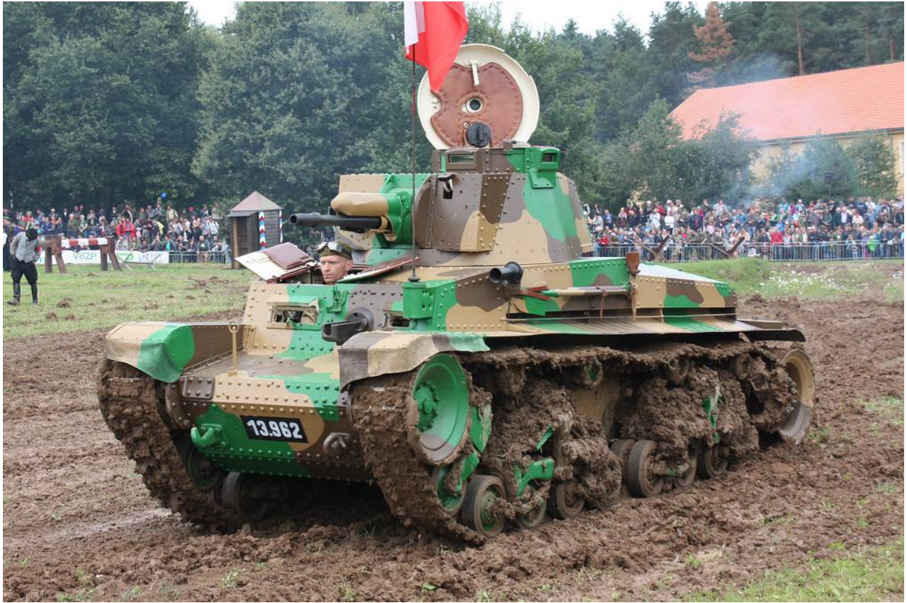
"adamicz", September 2013 - http://www.militaryphotos.net/forums/showthread.php?230009-Tank-Day-2013-in-Lesany-museum