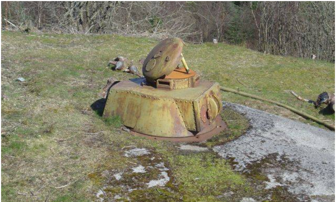
LT vz. 35 turret – Bergen area (Norway)