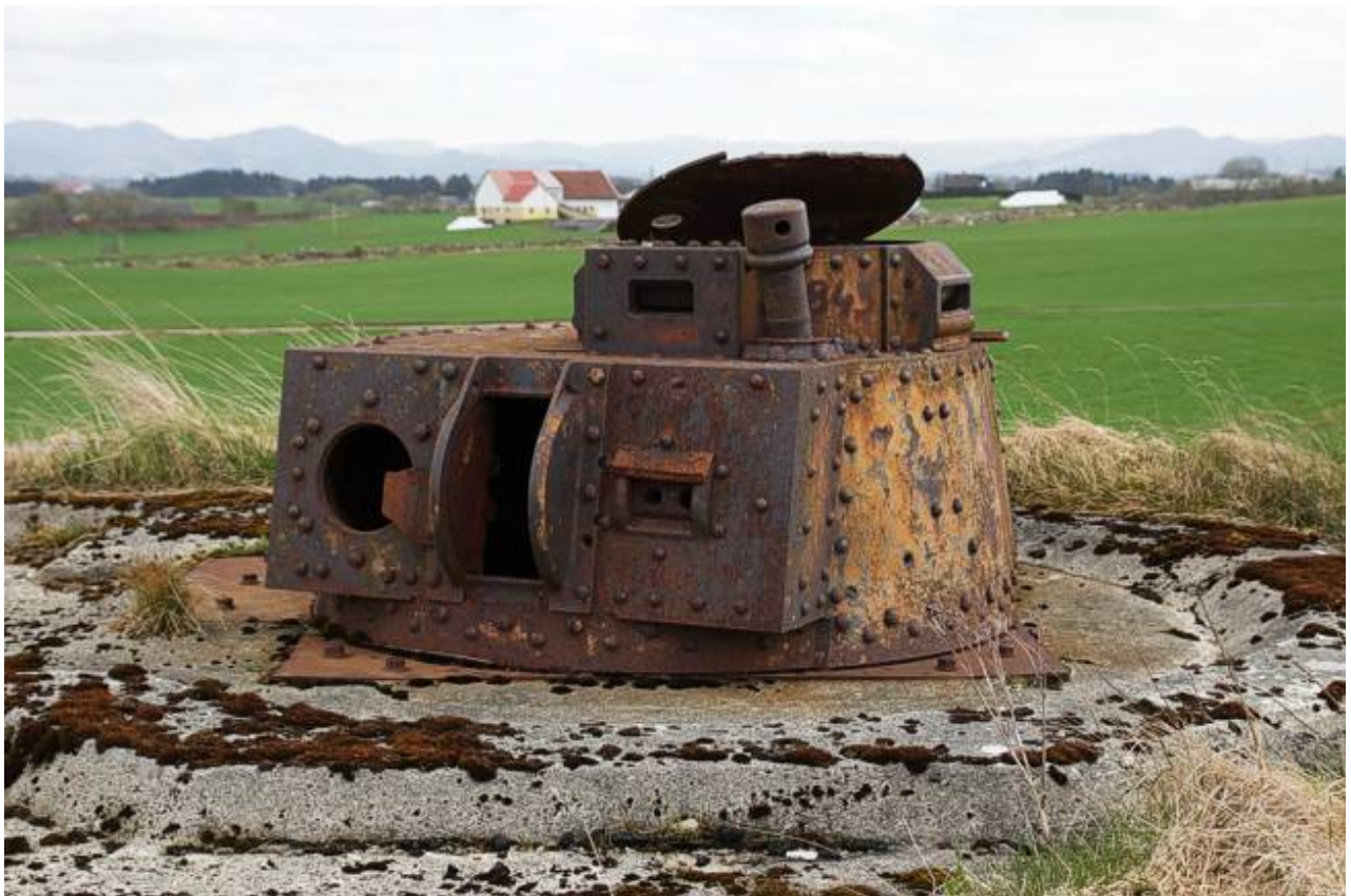
PzKpfw. 38(t) turret – Stp Zitadelle, near Stavanger (Norway)

http://bunkersite.com/locations/norway/rogaland/vftk-heigre.php