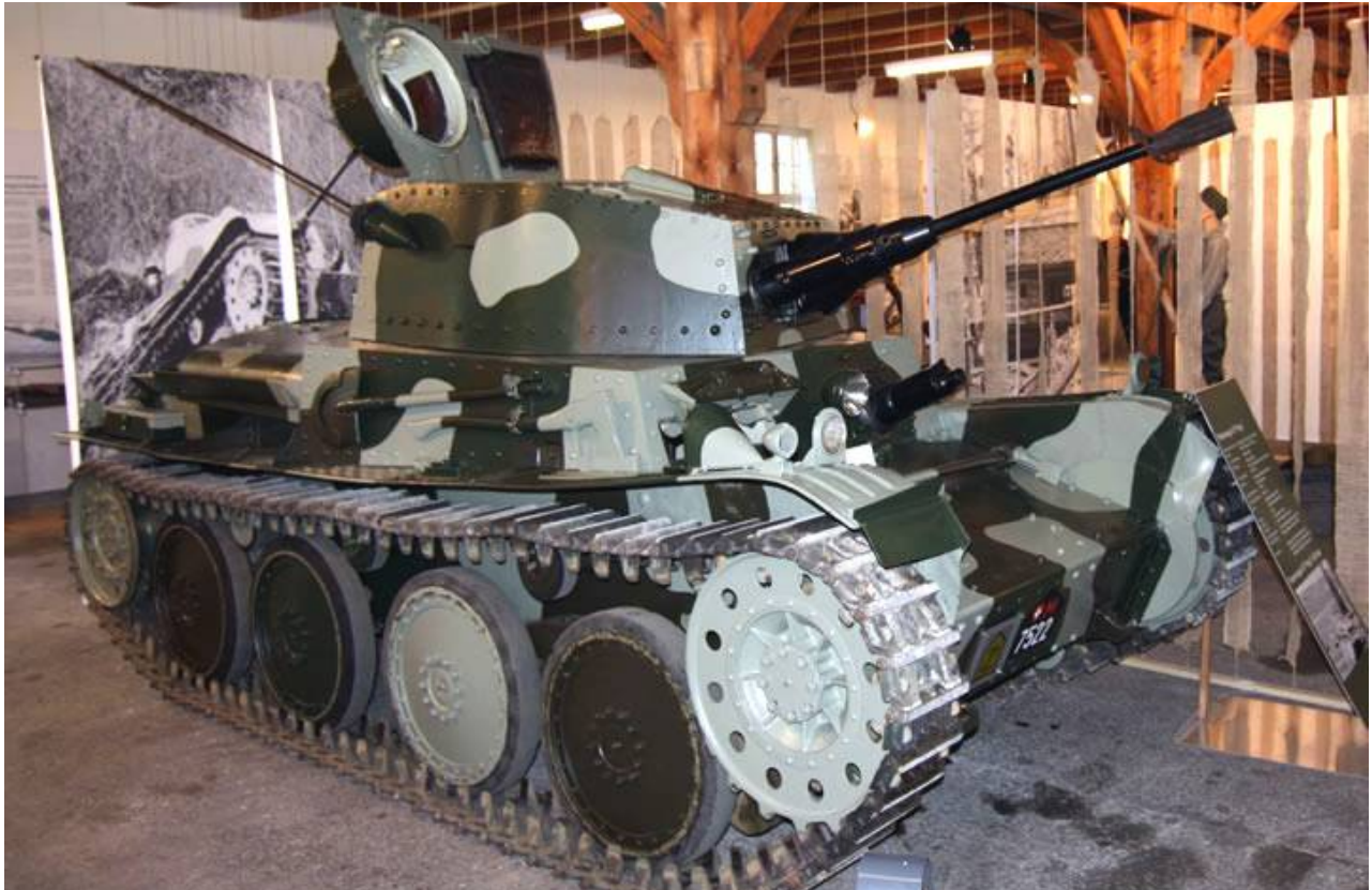
Massimo Foti, September 2009

LTH tank (M-7522) – Museum in Zeughaus, Schaffhausen (Switzerland) – running c.