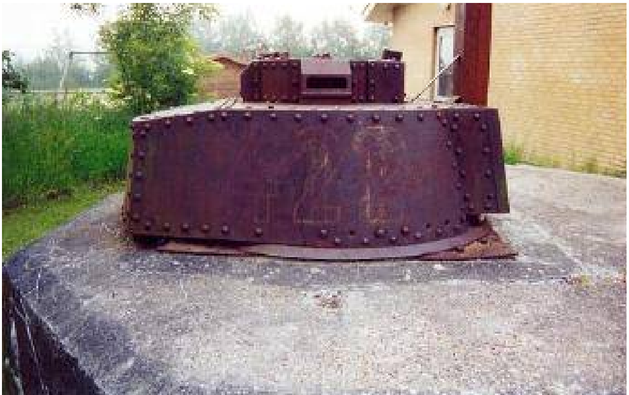
PzKpfw 38(t) turret – Private collection (Norway) Currently for sale

https://www.facebook.com/groups/sdkfz222/permalink/834918476640710/?_mref=message