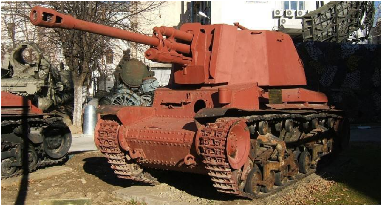
LT vz. 35 – National Museum of Military History, Sofia (Bulgaria)

Doug Kibbey, January 2007 - http://www.com-central.net/index.php?name=Forums&file=viewtopic&t=5132&start=45