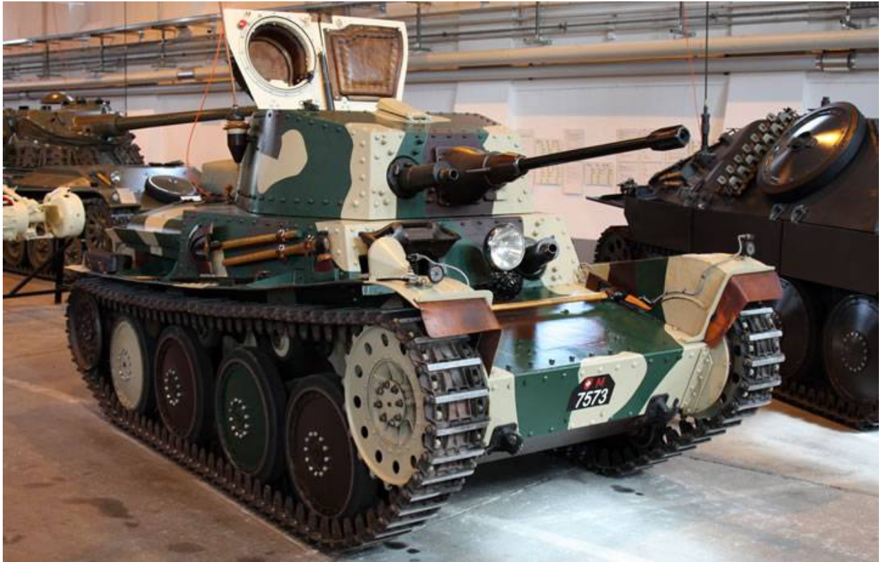
Massimo Foti, March 2010 - http://www.com-central.net/index.php?name=Forums&file=viewtopic&t=12545