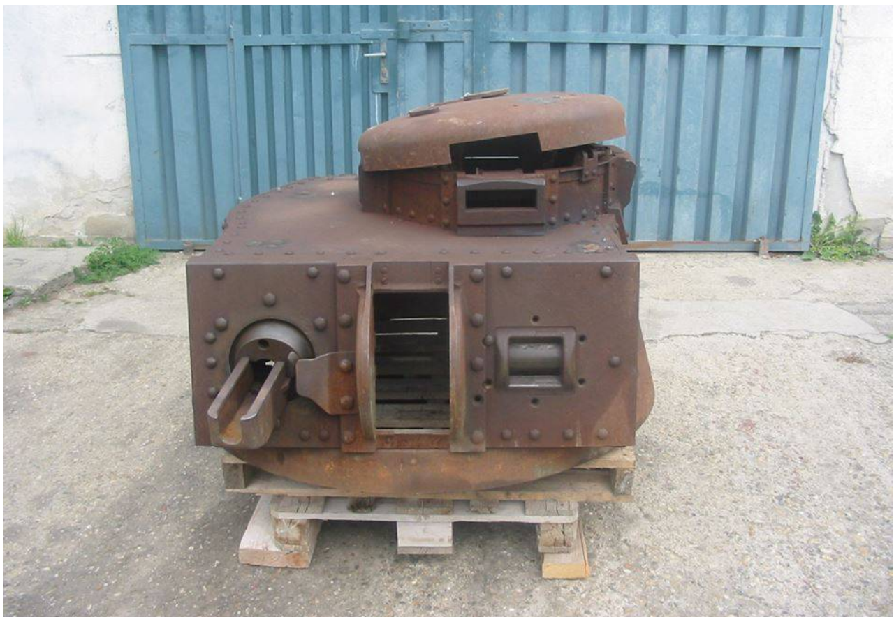
Two LT vz. 35 turrets – Unknown location