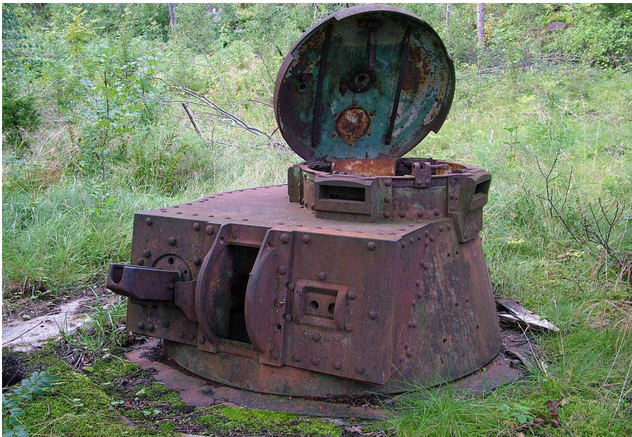
LT vz. 35 turrets – Kjevik airport, Kristiansand (Norway)

Erik Ettrup - http://www.panzerworld.net/panzerturretsnorway