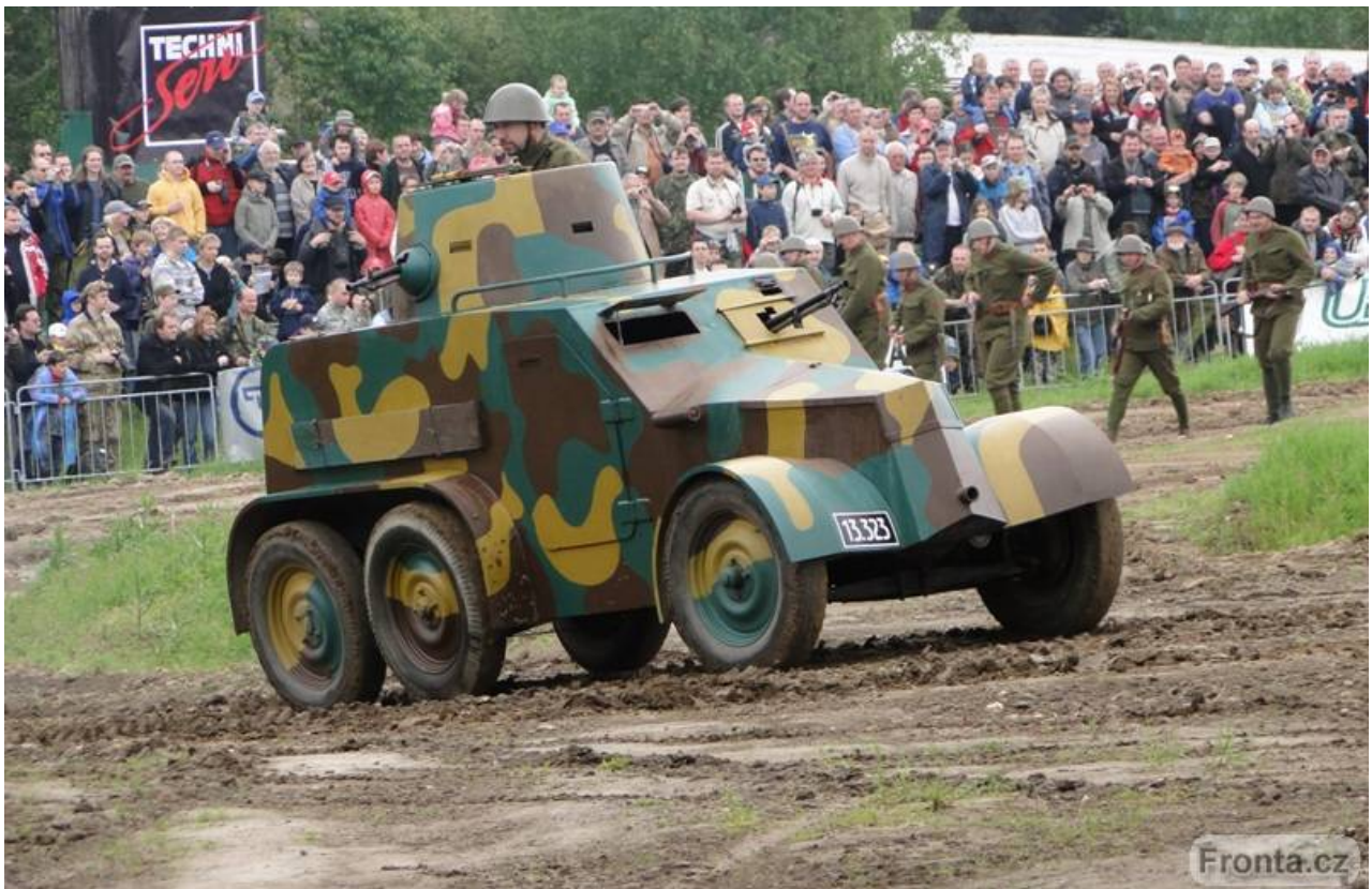
PzKpfw 38(t) turret – Unknown location (Norway?)

http://www.fronta.cz/fotogalerie/obrnny-den-lesany-2010