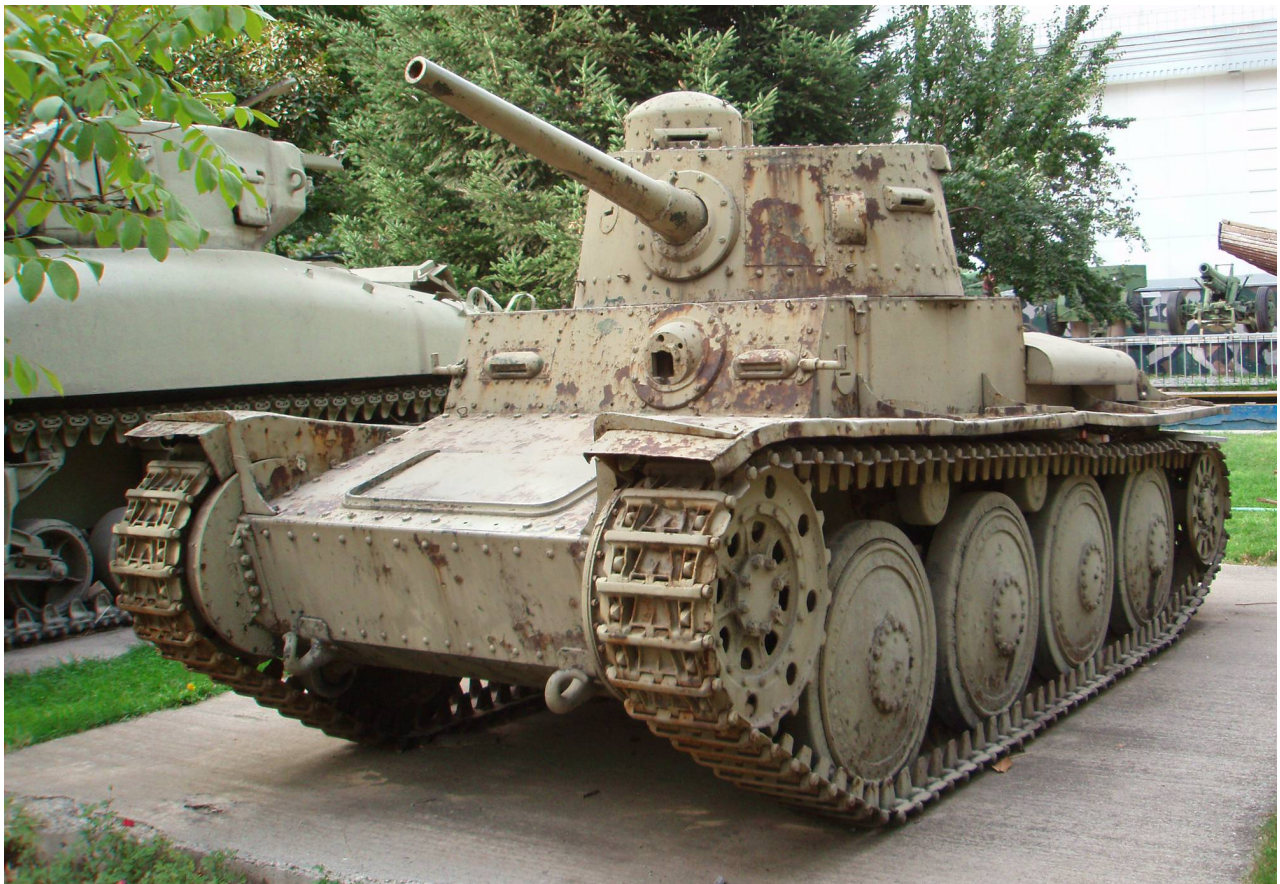
Anatoly Terentiev, October 2008 - http://en.wikipedia.org/wiki/Image:%D0%A2%D0%B0%D0%BD%D0%BA.jpg

Previously displayed in Zvolen (Slovakia). This vehicle (incl. hull/chassis) is integrated in an armored train. This armored train served in Slovakia during the National Uprising in 1944 (David Šolc)