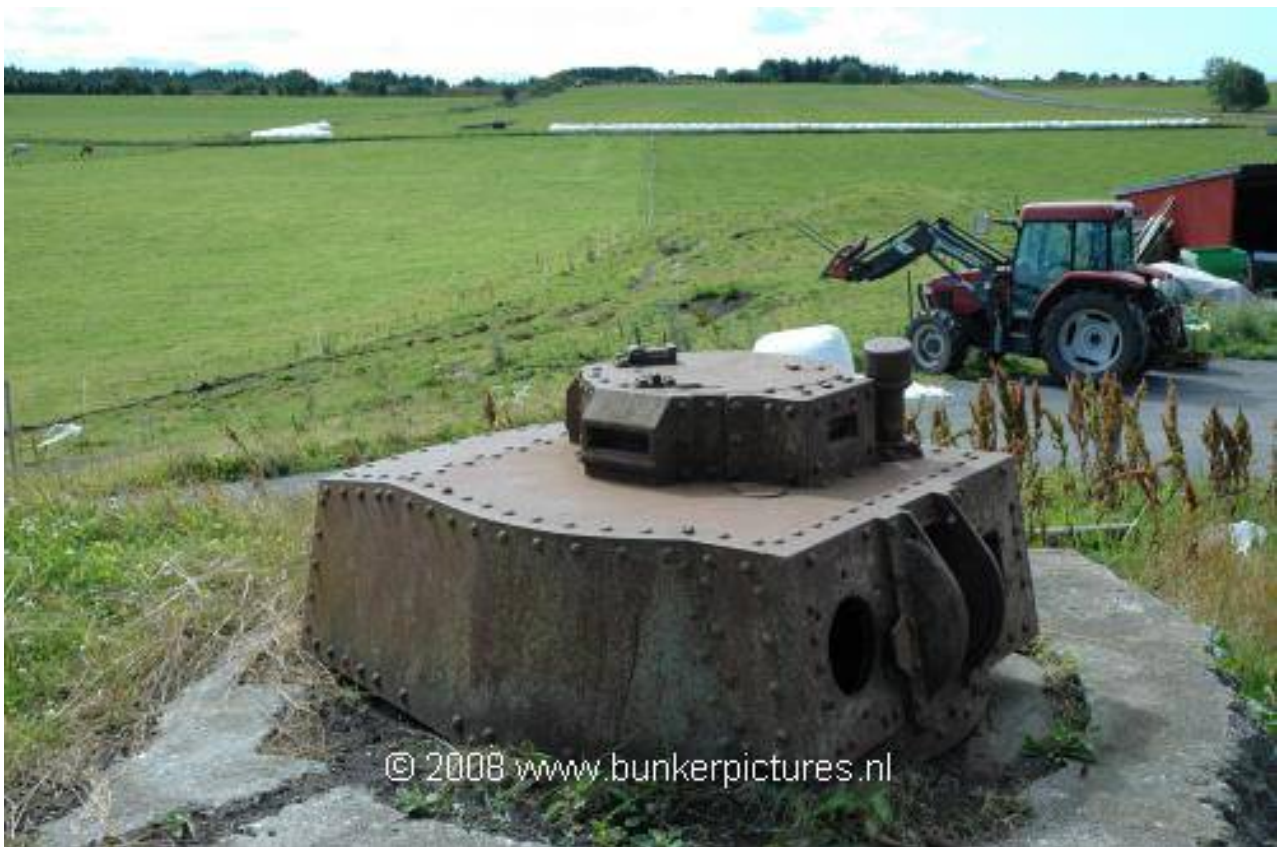
3rd PzKpfw. 38(t) turret – Inland defence line, Gossa Island, Møre og Romsdal (Norway)

http://www.bunkerpictures.nl/pictures/norway/more%20og%20romsdal/gossen/landfront/aanvang.html