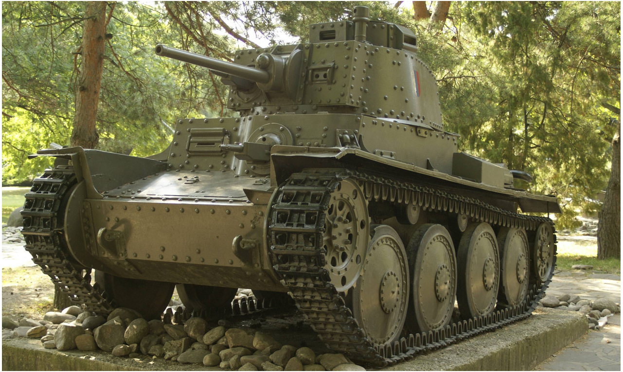
Rafal Białecki, September 2008