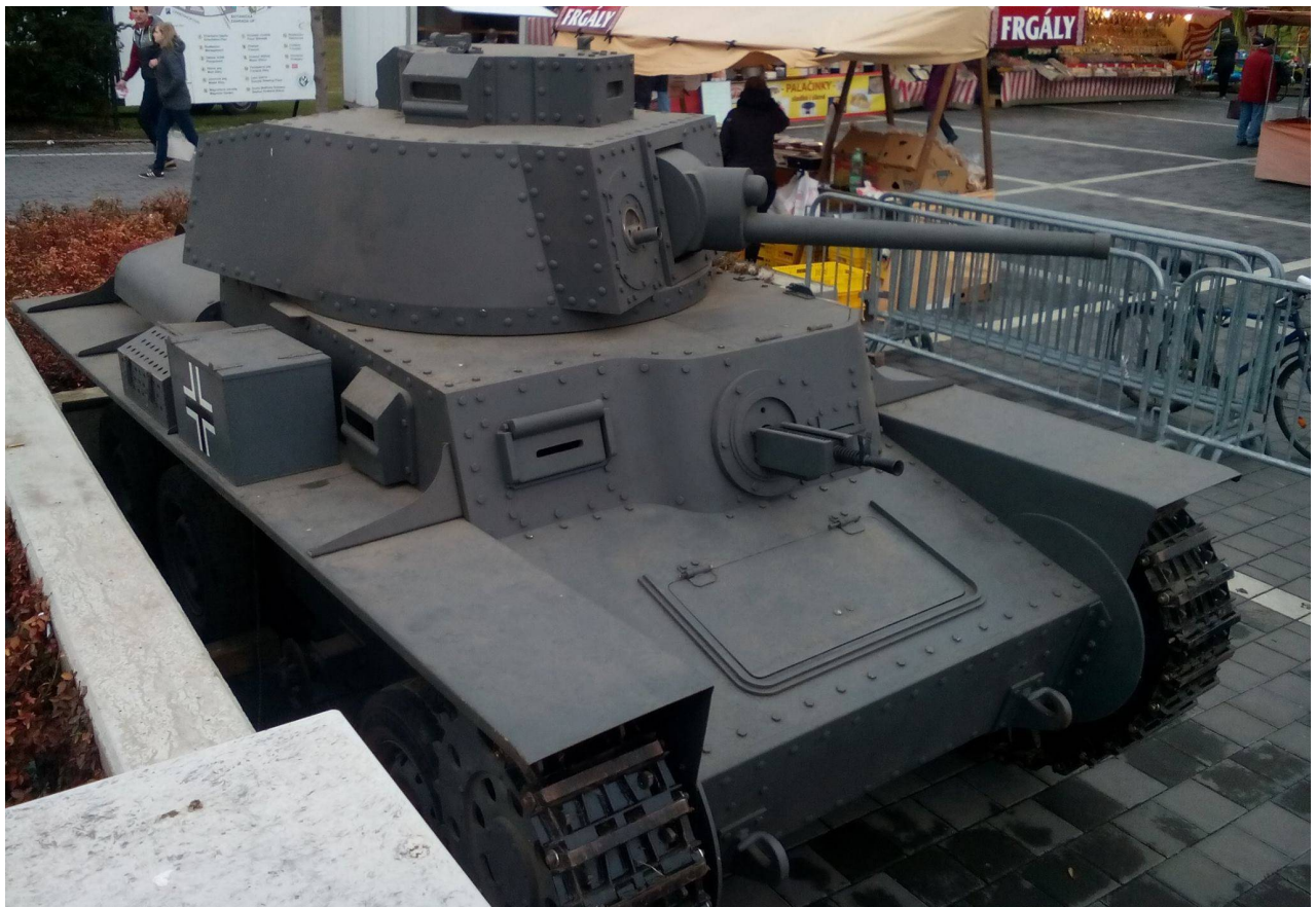
AH-IV-R (reproduction) – Vojenského muzea Lichkov (Czech Republic)

https://www.facebook.com/VHKErika/photos/a.1843371469256672.1073741843.1420159451577878/1843371502590002/?type=3