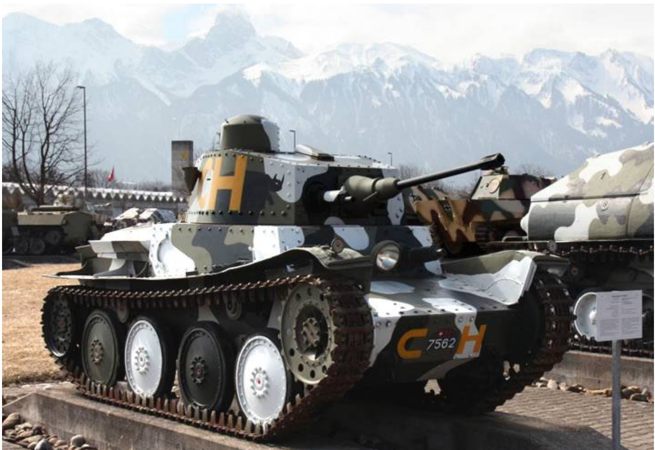
Massimo Foti, March 2010 - http://www.com-central.net/index.php?name=Forums&file=viewtopic&t=12552

LTH : export version to Switzerland of the LT vz. 38 (Lahky Tank LT 38/Panzerkampfwagen 38 (t)) (Wikipedia)