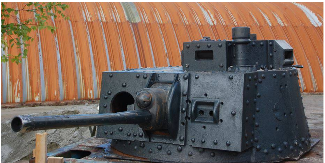
PzKpfw 38(t) turret – Rogaland Krigshistoriske Museum (Norway)

https://www.facebook.com/photo.php?fbid=10204269180278515&set=p.10204269180278515&type=1&theater&_mref=message