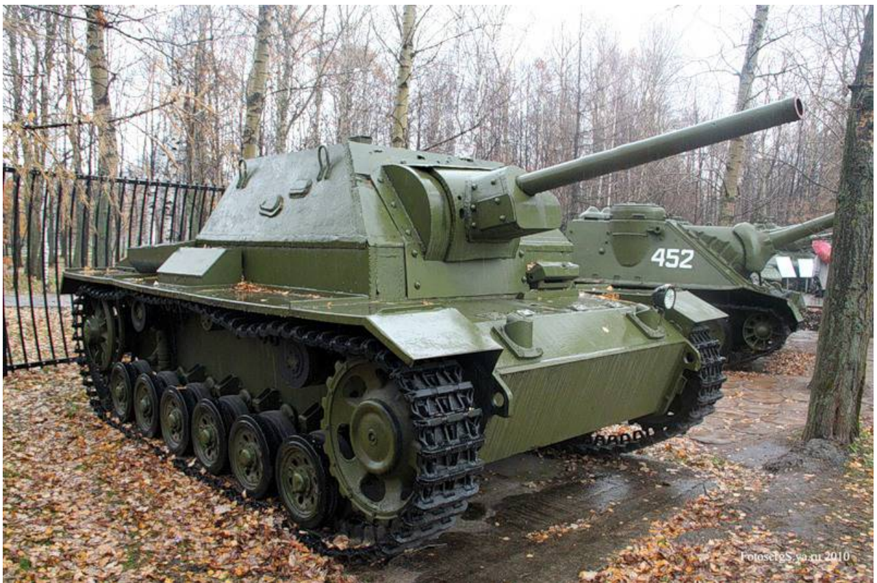
SU-76i (Russian Assault gun based on PzKpfw. III Ausf. H/J) Sarny, Rivne Oblast (Ukraine)

"FotosergS", November 2010 - http://fotki.yandex.ru/users/FotosergS/view/321744/?page=6