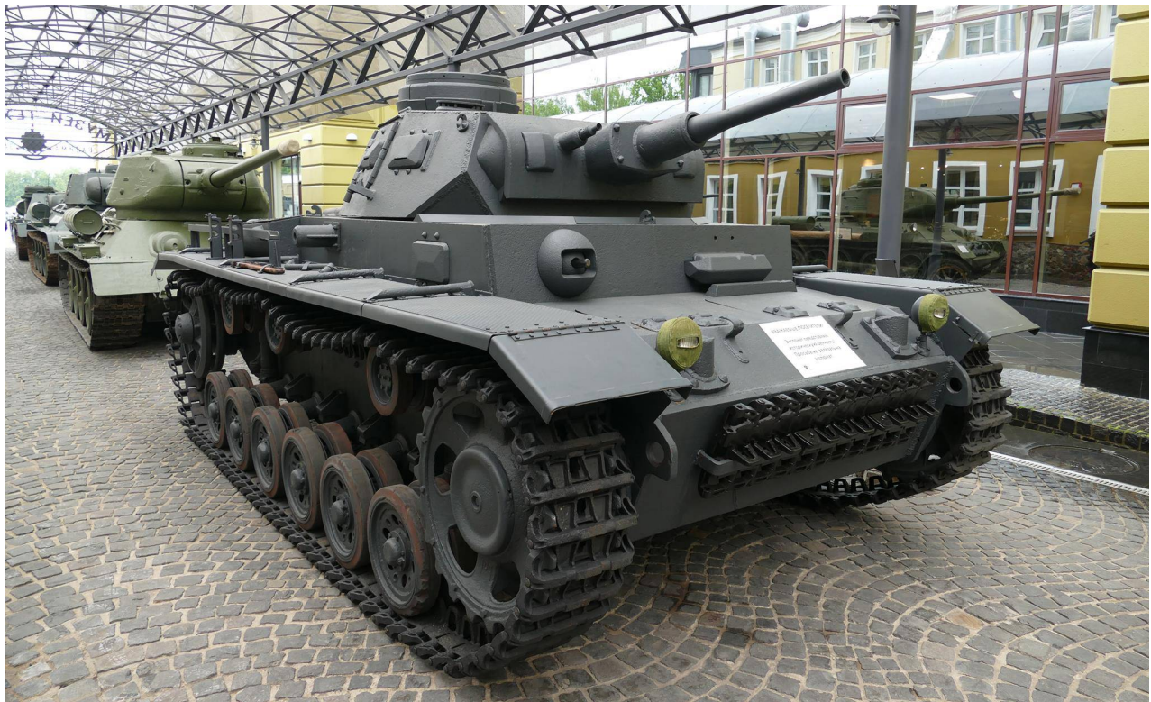
Yuri Pasholok, June 2017

Fahrgestell number 72527, produced by MAN in late December 1941 or January 1942 (Yuri Pasholok). On a photo made at Kubinka in 1946, "the White phantom" - the emblem of 11th Panzer-Division - is visible on this tank. Characteristic for this division is two-valued tactical number "24". The 11th division didn't fight at Stalingrad, but tried to make the way to the encircled troops (Alex Pankov). This tank is everywhere yellow from inside and outside, it was built surely for DAK, but used in Russia (Dmitry Bushmakov)