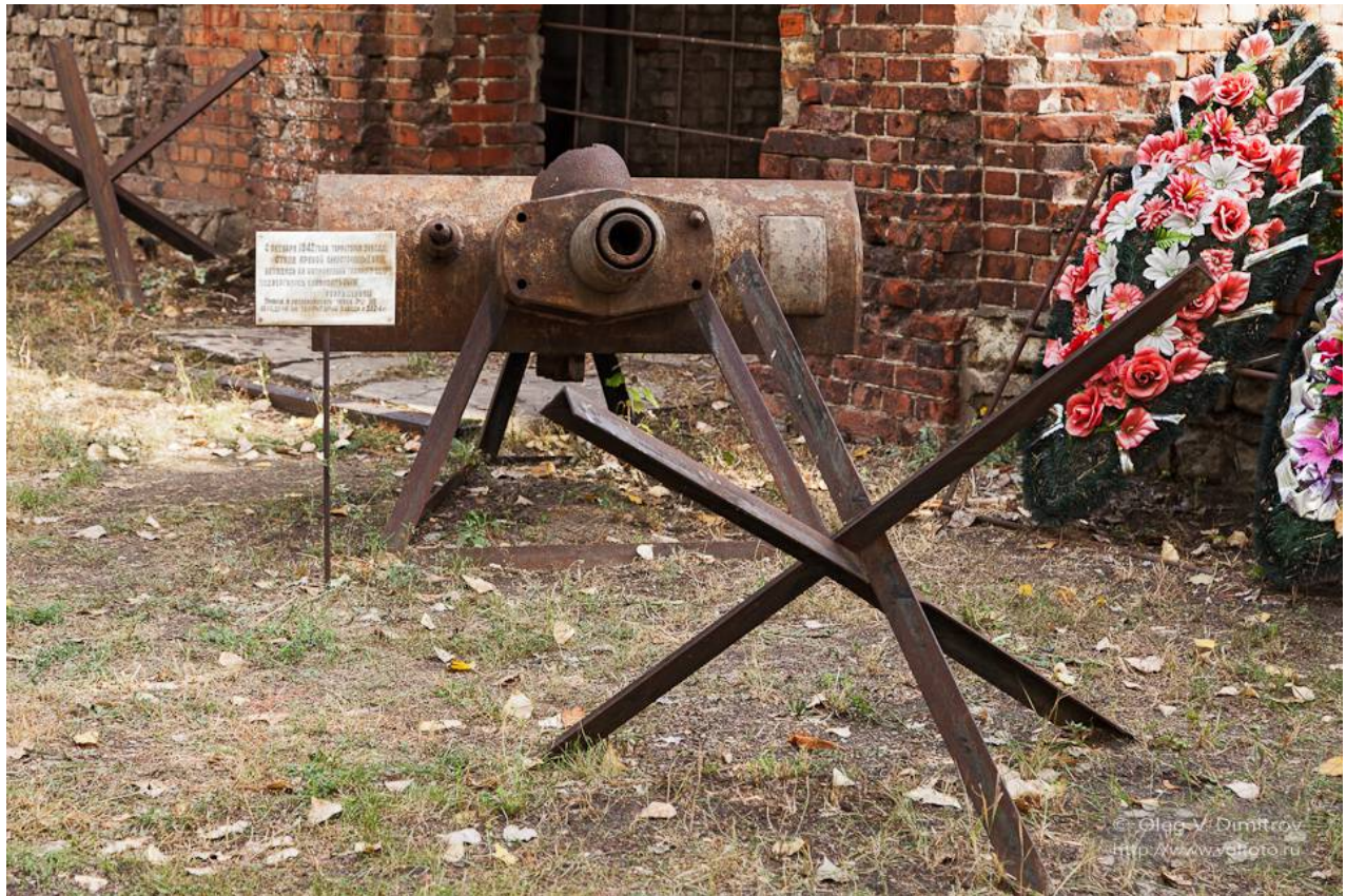
Oleg Dimitrov, October 2012 - http://www.volfoto.ru/volgograd/photos/3965.html