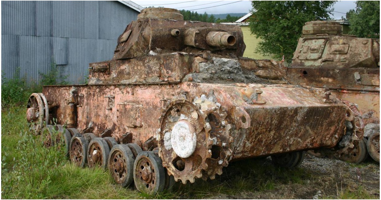
Arild Thrane Sandnes, August 2007 - http://www.tpmk.no/Forbilder/Panzer%20Setermoen.htm