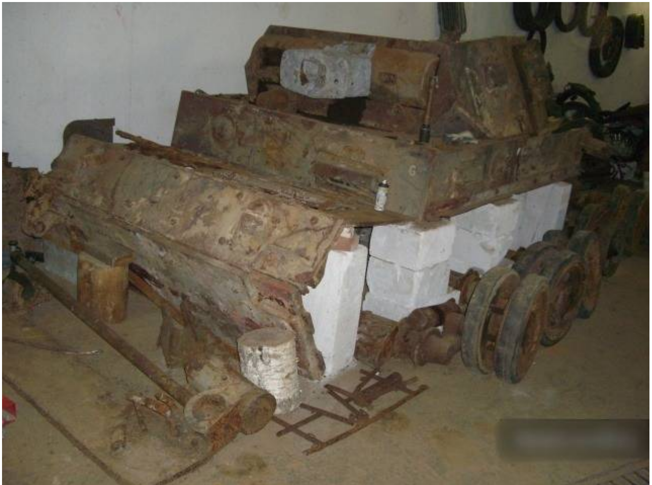
PzKpfw. III partial turret – Moscow Defence State Museum, Moscow (Russia)

https://www.facebook.com/kurlandkessel1945/photos/a.784394268243792/3353981611285032/