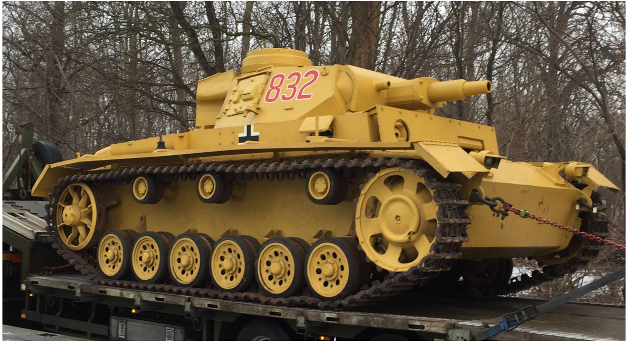
Niels Vegger, January 2016