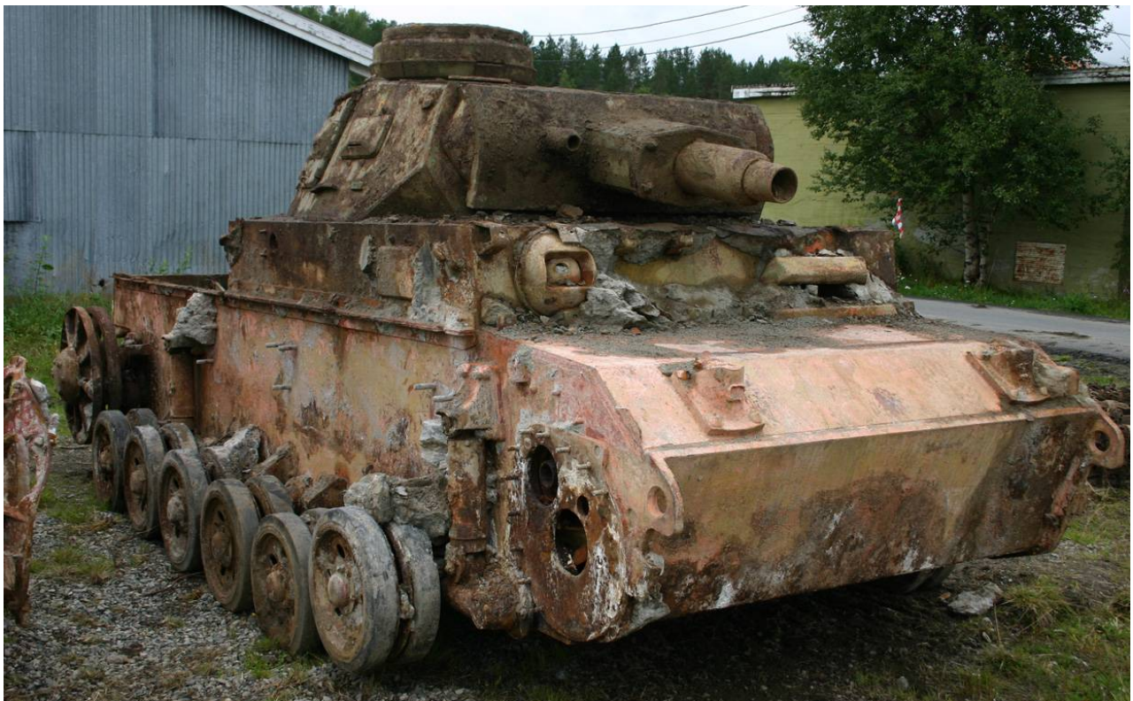
Arild Thrane Sandnes, August 2007 - http://www.tpmk.no/Forbilder/Panzer%20Setermoen.htm