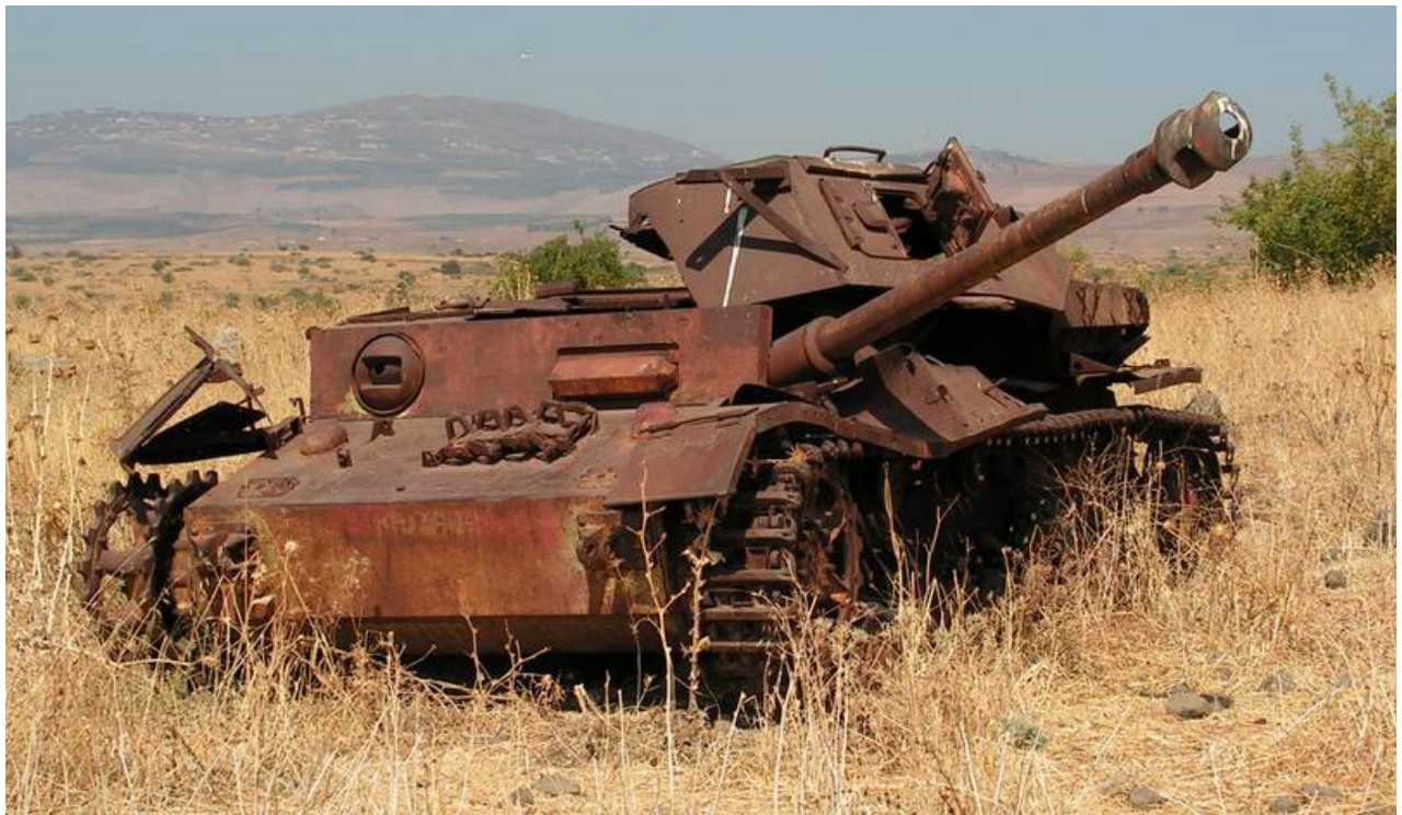
Dmitriy Tubin, 2011 - http://www.dishmodels.ru/wshow.htm?p=1953

http://www.com-central.net/index.php?name=Forums&file=viewtopic&t=8865