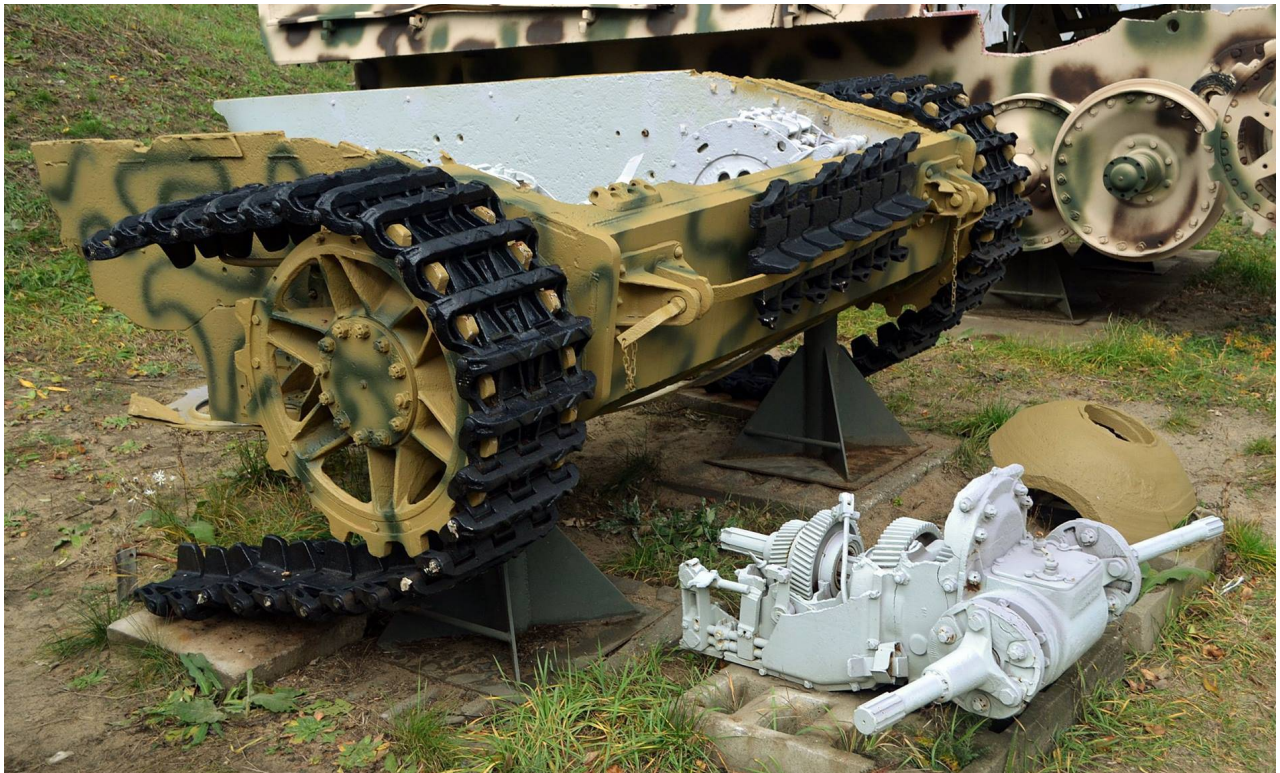
PzKpfw. IV Ausf. F2 upper hull and turret – Private collection (Latvia?) These remains were found in Ukraine

"Militarne Podróże", November 2015 - https://www.facebook.com/