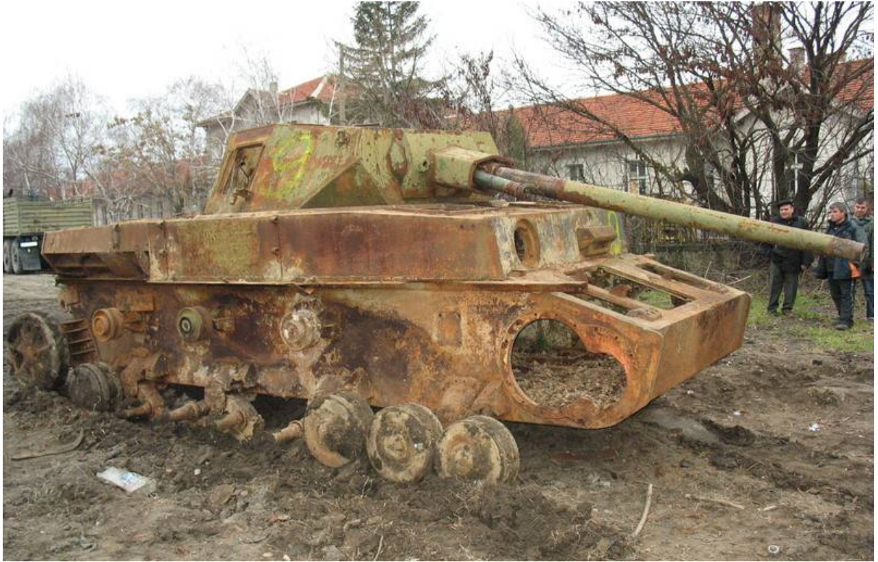
"valko-bg", February 2008 - http://www.scalemodels-bg.com/phpbb/viewtopic.php?t=136&postorder=asc&start=165