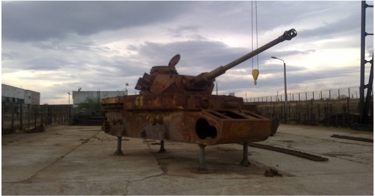
Dobromir Dimitrov, October 2011