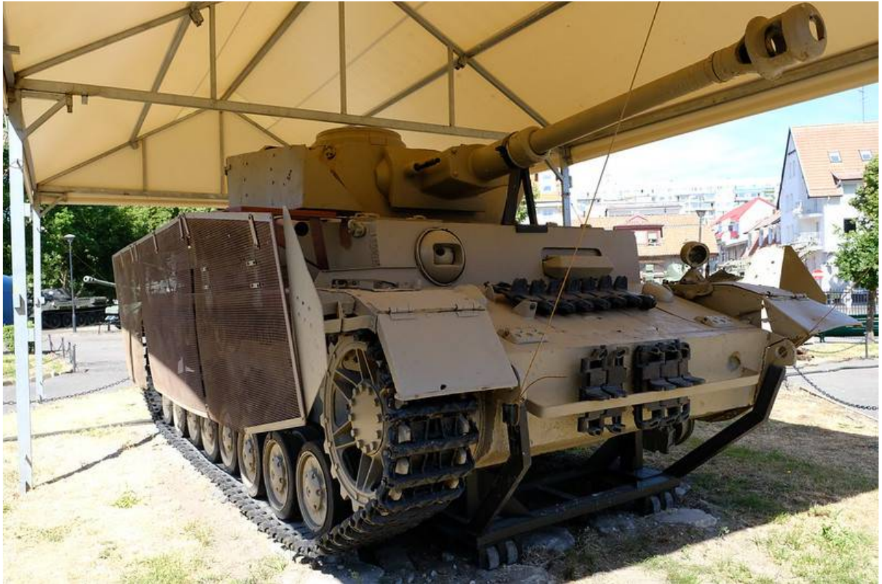
"270862", June 2018 - https://www.flickr.com/photos/131561895@N06/29153760958/in/album-72157696722333441/