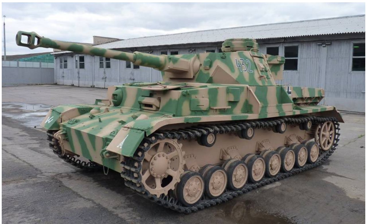
T-40/75 (PzKpfw. IV Ausf. H) – Khmeimim air base, near Lattaquié (Syria)

Yuri Pasholok, April 2010 - http://www.com-central.net/index.php?name=Forums&file=viewtopic&t=12655