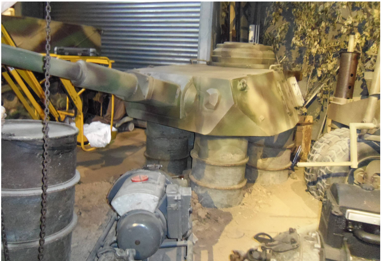
PzKpfw. IV hull and turret – André Becker Collection (Belgium)

https://www.facebook.com/media/set/?set=a.829484870414009.1073741858.801749283187568&type=1