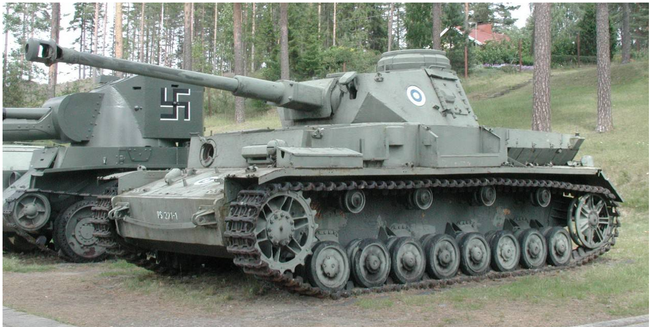
Esa Muikku, June 2002