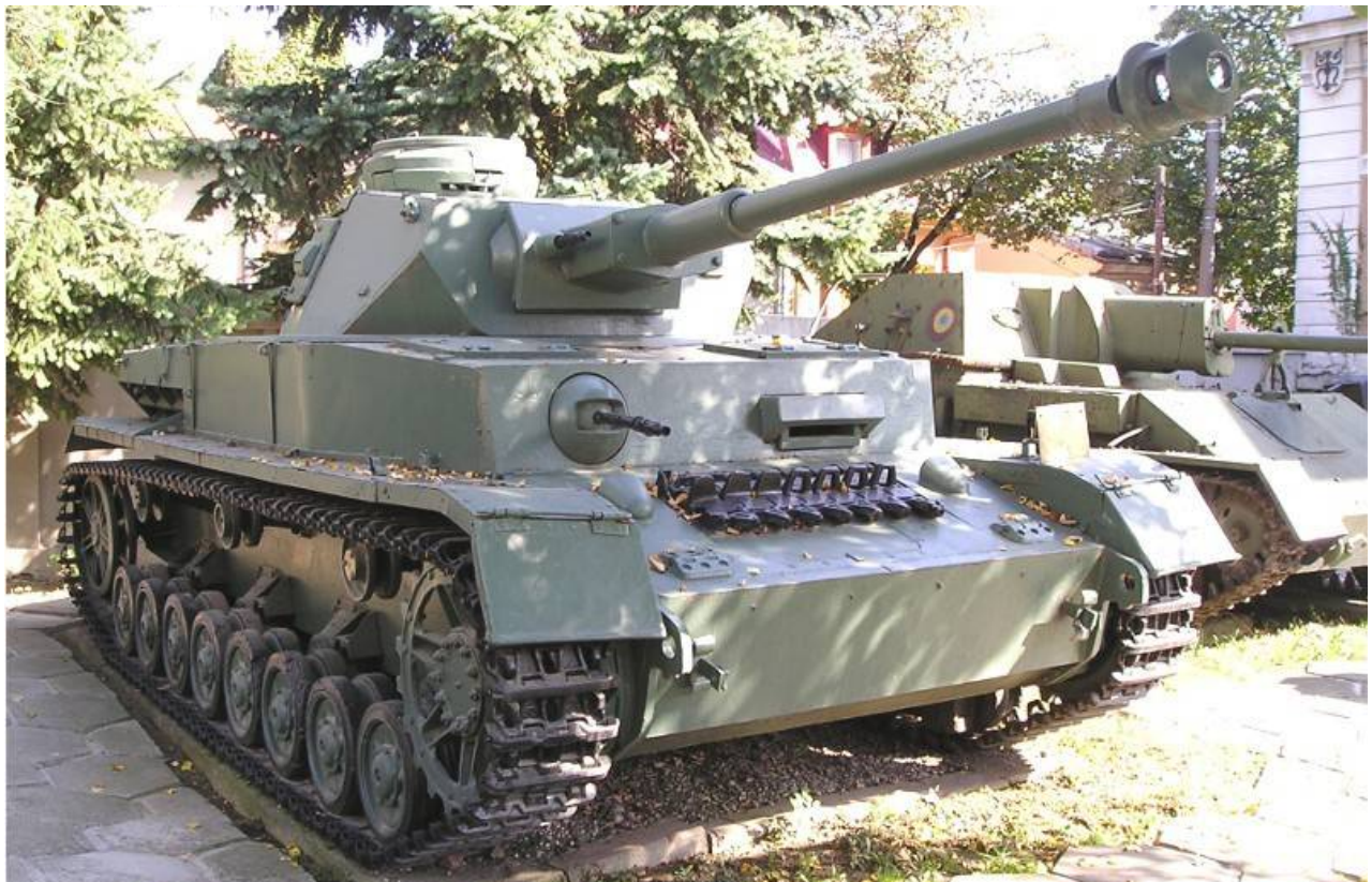
Doug Kibbey, October 2006 - http://www.com-central.net/index.php?name=Forums&file=viewtopic&t=5132