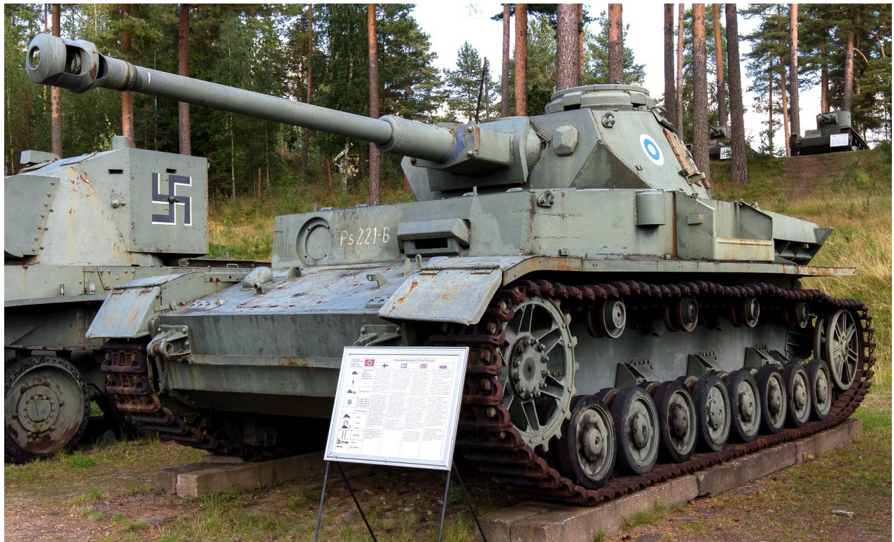
Axel Recke, September 2015