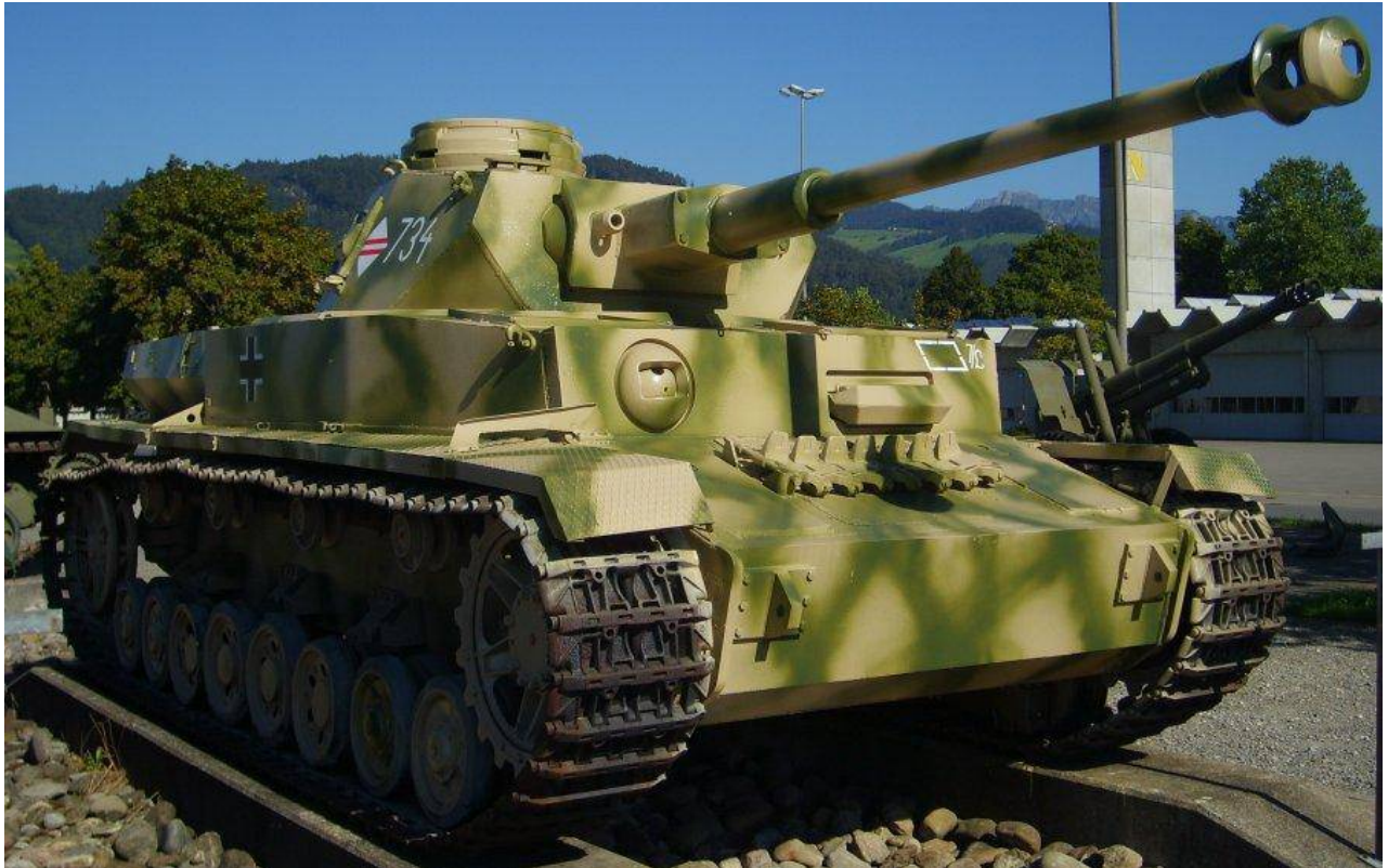
Stephen Drew, September 2006 - http://tanxheaven.com/sd/ThunTankMuseum2006/ThunTankMuseum06.htm