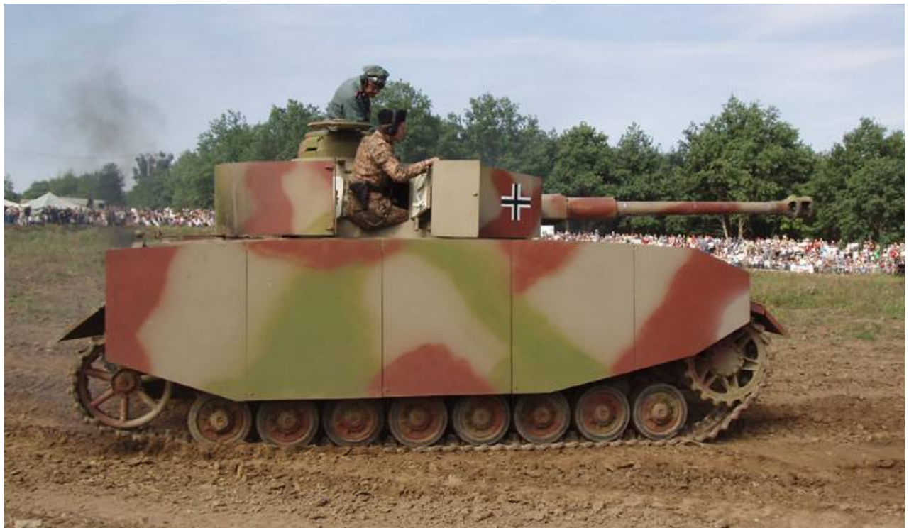
August 2005

The tank has been recovered in April 2011 from a field near the airport, near Stargard Kluczewo. The parts were transferred to the Armoured Weapons Museum, Land Forces Training Centre in Poznań. It has been rebuilt from the parts recovered. The tank was supposedly blown up by its crew or a shell in 1944 or 1945 (info. from the museum). Fahrgestell number 93173 (Maciej Boruń)