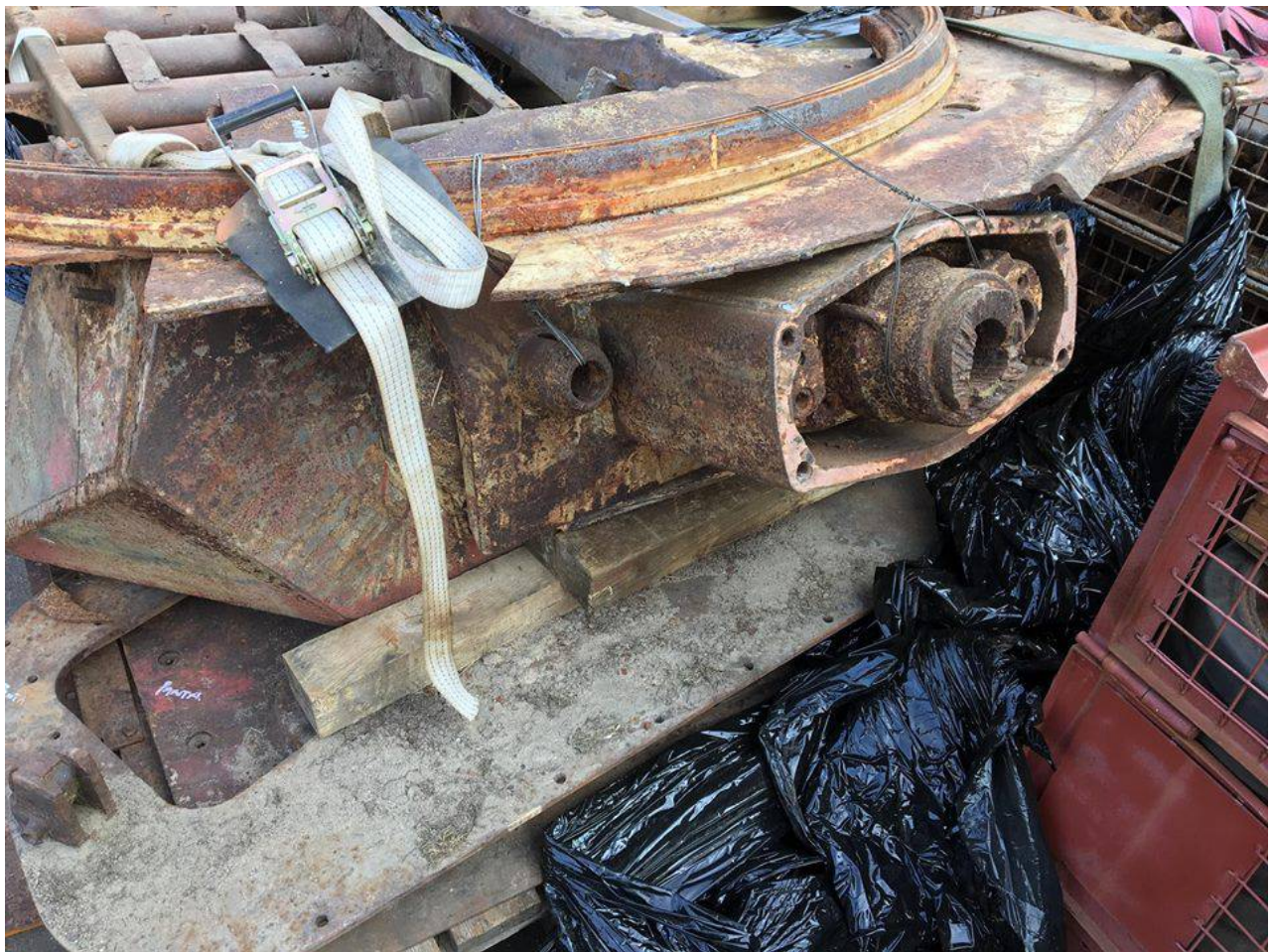
T-40/75 (PzKpfw. IV) wreck – Lake Kinneret area, Golan heights (Israel) Fahrgestell number 110099, reportedly manufactured by Nibelungenwerke

http://forum.valka.cz/viewtopic.php/title/-Pz-Kpfw-IV-v-sluzbach-cudzich-armad/p/136933