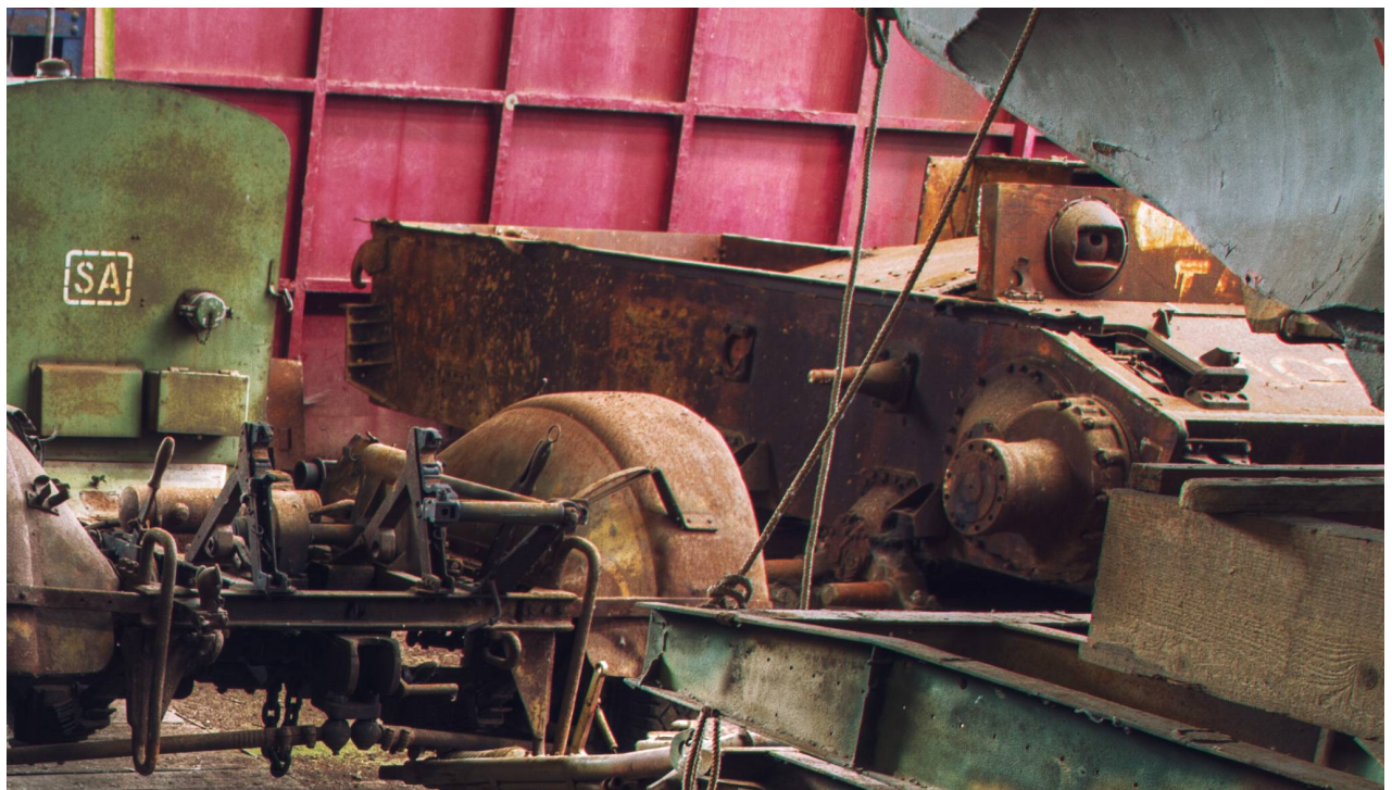
PzKpfw. IV HL 120 TRM engine – Museum für historische Maybach-Fahrzeuge Oberpfalz (Germany)

Sebastien Ernest, March 2013 - http://www.flickr.com/photos/bestarns/8552592794/in/set-72157632907384026