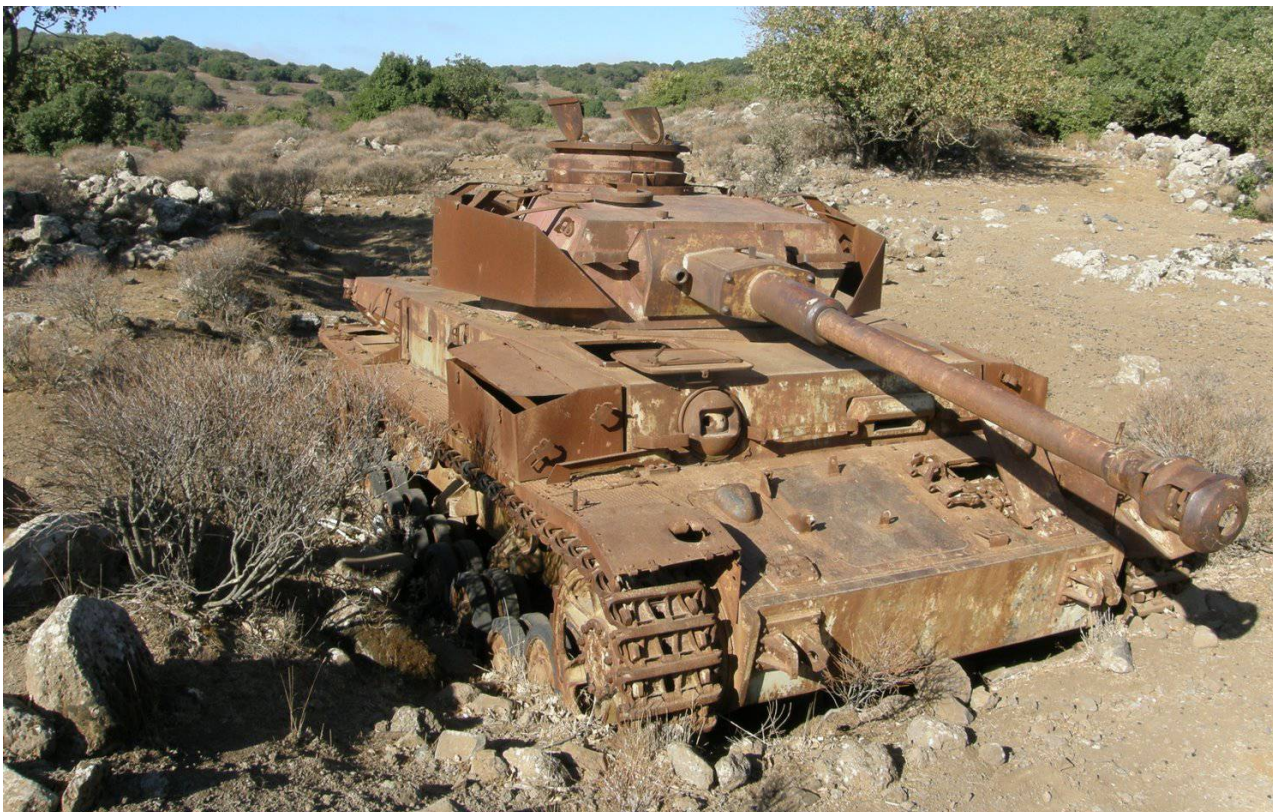
"tomasz", October 2008 - http://picasaweb.google.com/golona1981/PanzerIV#

PzKpfw. IV Ausf. G with Thoma experimental hydraulic drive U.S. Army Center for Military History Storage Facility, Anniston, AL (USA) Formerly part of the Aberdeen proving ground museum