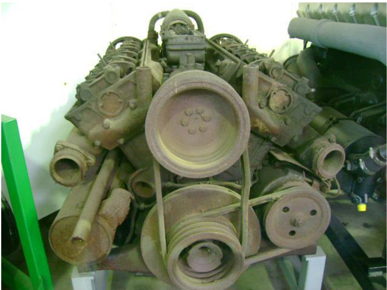
PzKpfw. IV Ausf. D turret – Munster Panzer Museum (Germany)