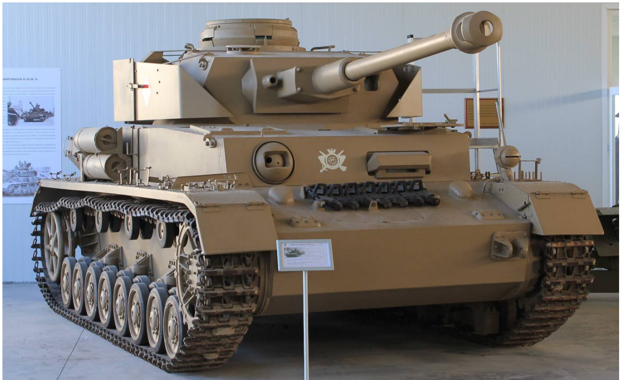
Didier Bouvy, October 2014