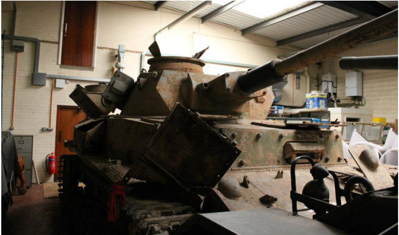
"The_Challenger", November 2012 - http://www.facebook.com/media/set/?set=a.453885897980390.93729.433891793313134&type=3