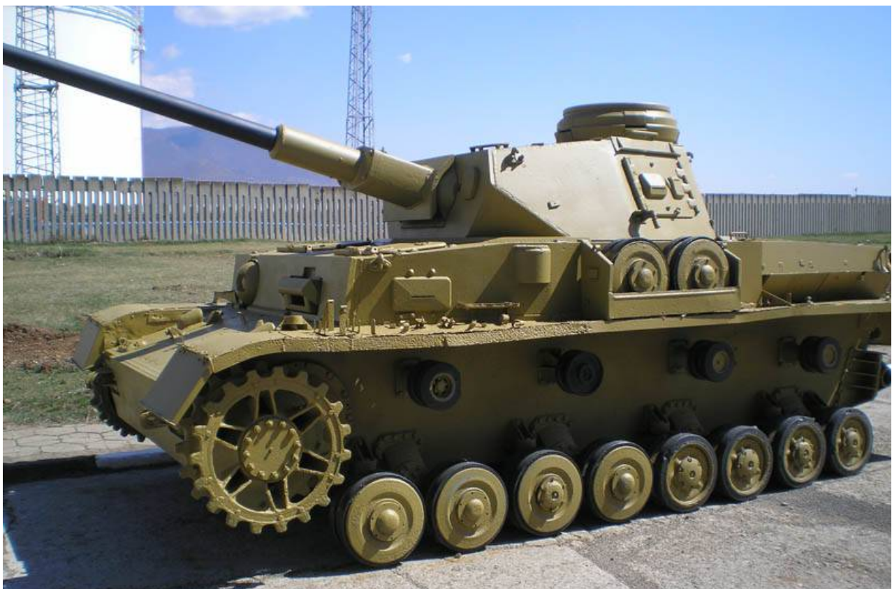
Dobromir Dimitrov, April 2012

The restoration project started with the arrival of a Panzer IV Ausf. F turret in Poklonnaya Gora, 10 years ago. The hull is made from new, but some parts of the superstructure are original (front glacis, front-left, back-right). The suspension is half original. Some little details are original. All original parts are recovered from the ground (AFV News forum)