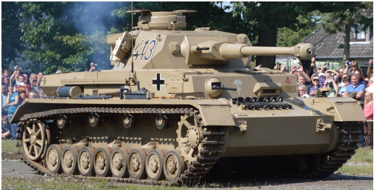
Bernd Borchert, September 2012

More photos of this tank can be seen here : http://www.wheatcroftcollection.com/PzKpfwIV.html