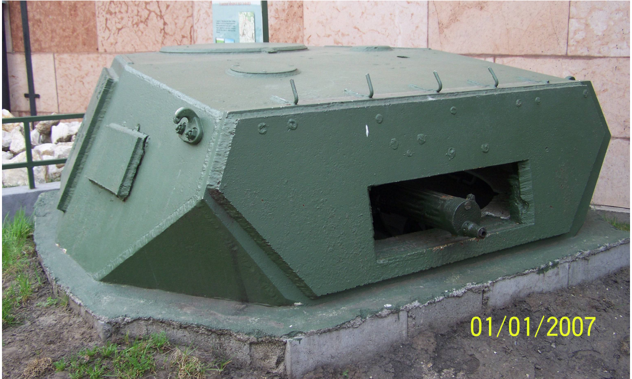
Ferenc Bálint, March 2010