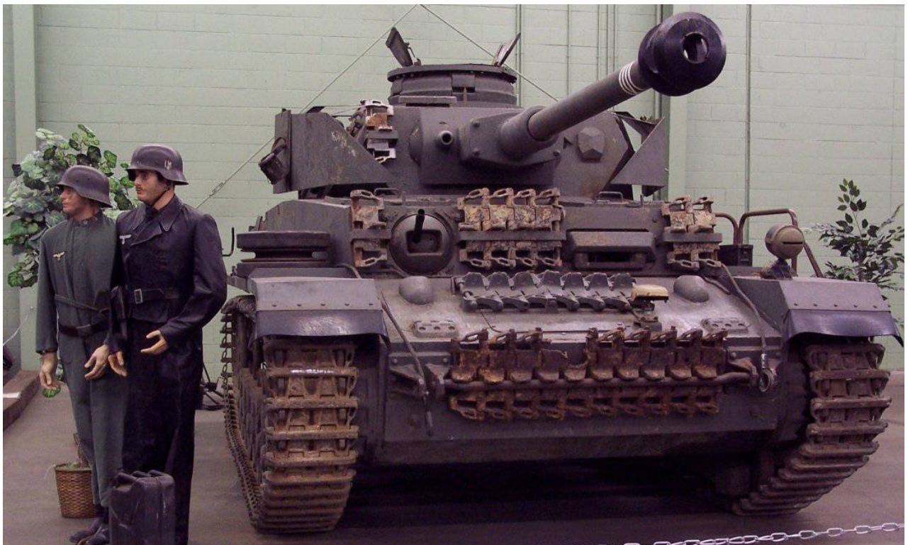
Art Tyng, Spring 2005 - http://rctankcombat.com/battle-reports/DanvilleSpring2005/

This tank is an Ausf. H/J chassis and turret with either an Ausf. A to E main gun, or a gun with a cut up barrel