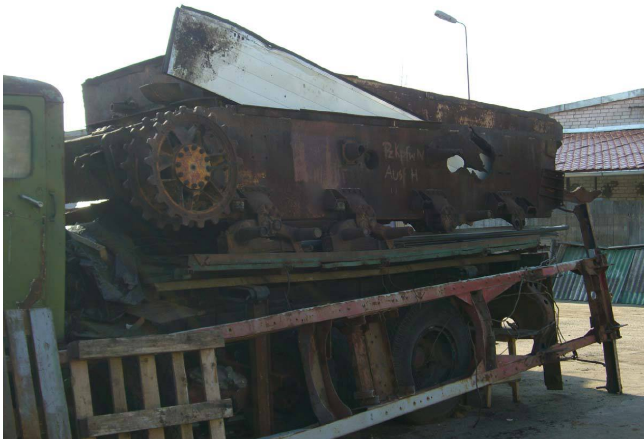
"BIGRED", March 2008 - http://opozit.ru/modules.php?name=Forums&file=viewtopic&t=29696