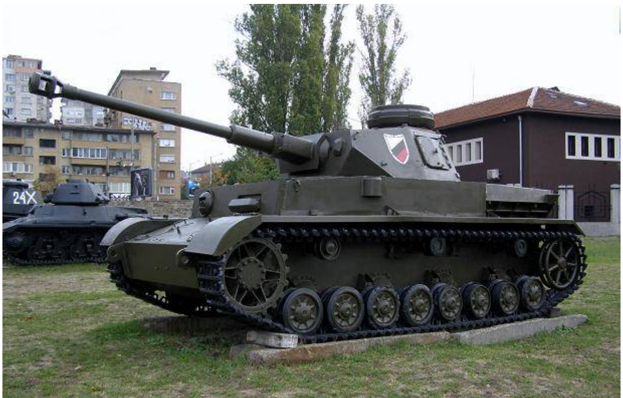
“=VNVV=Rosev”, November 2011 - http://www.scalemodels-bg.com/phpbb/viewtopic.php?f=53&t=136&start=1200

“From what we could discern from a file coming from the museum, the vehicle came to grief in the Battle for Romania, probably in summer '44. It either took a hit that resulted in the loss of the original turret (I didn't see any obvious damage to the hull, inside or out) or the chassis may have come to be captured and used by the Russians for a period (possibly as a personnel or ammo carrier) as it was recovered with some Cyrillic overwriting on some of the operating controls (instruments are now absent). With the end of hostilities, it came to rest at the museum and a “donor turret” from unspecified sources came via the Romanian Military School to be installed on the chassis to complete the exhibit as it is seen today” (Doug Kibbey)