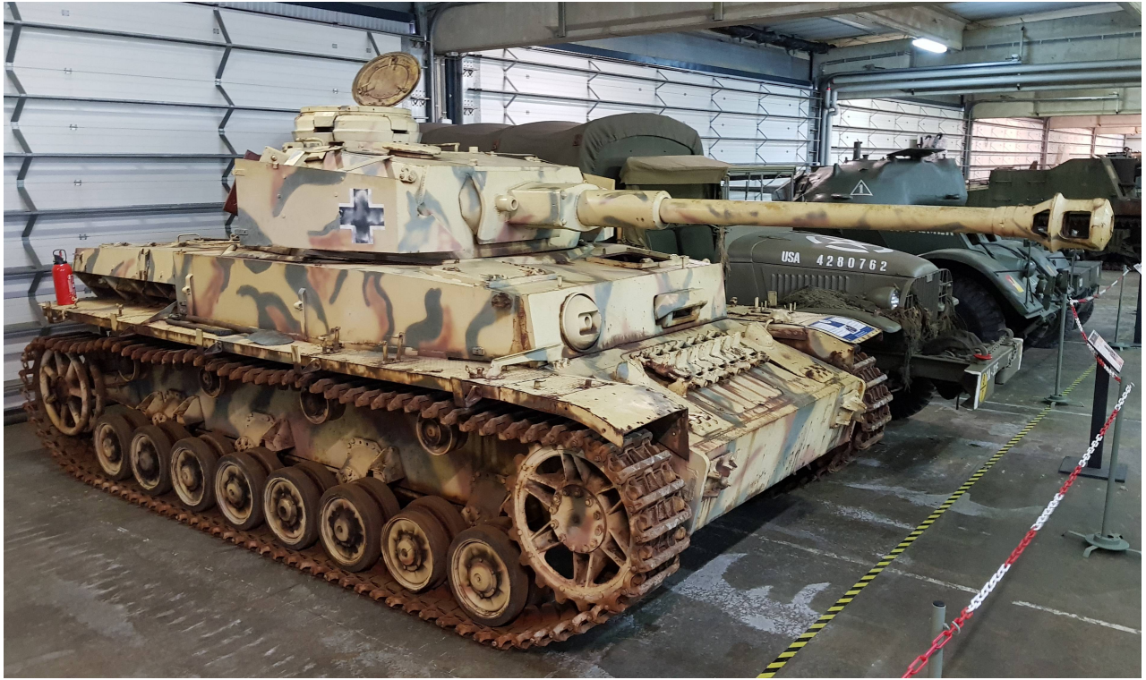
Pierre-Olivier Buan, April 2019