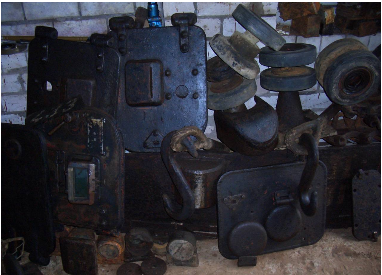
T-40/75 (PzKpfw. IV) bottom hull – somewhere in Israel (Golan heights area?)

"borowiki", November 2008 - http://www.forfree.hc.pl/eksploracja/viewtopic.php?t=725&postdays=0&postorder=asc&start=30