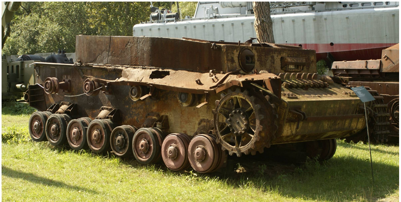
Rafał Białęcki, September 2008

PzKpfw. IV restoration project – Museum im. Orła Białego, Skarżysko-Kamienna (Poland) The museum announced in late February, 2021 that the Panzer IV would be completely restored, probably to running condition