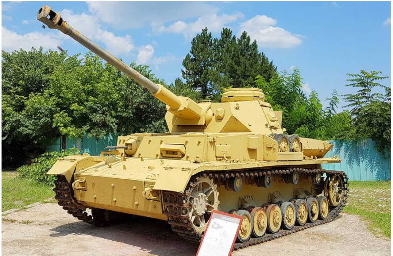
PzKpfw. IV Ausf. H – Kalemegdan Military Museum, Belgrade (Serbia)

https://hiveminer.com/Tags/%D0%B1%D0%BE%D0%B9%D0%BD%D0%B0%D1%82%D0%B0