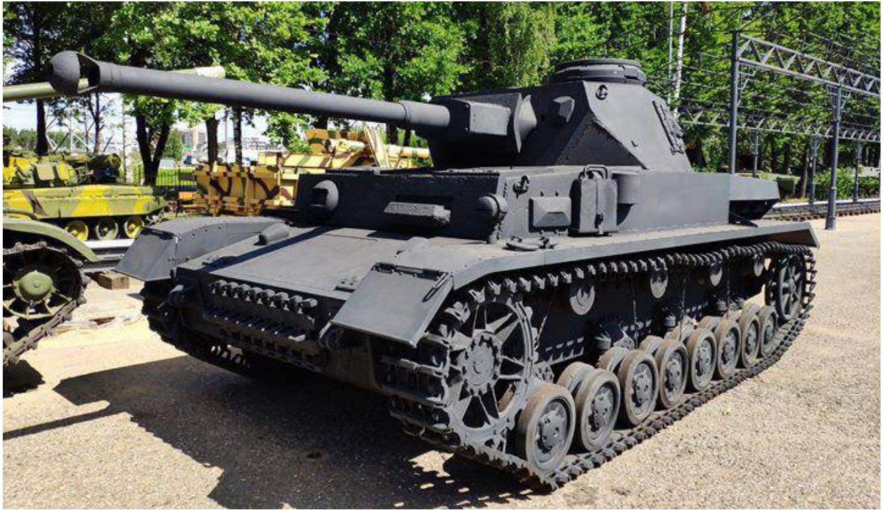
Dobromir Dimitrov, July 2019