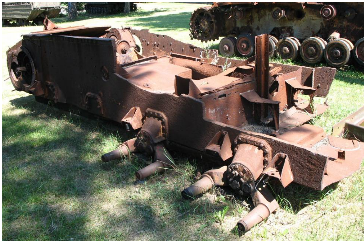
"Vlaad", July 2006