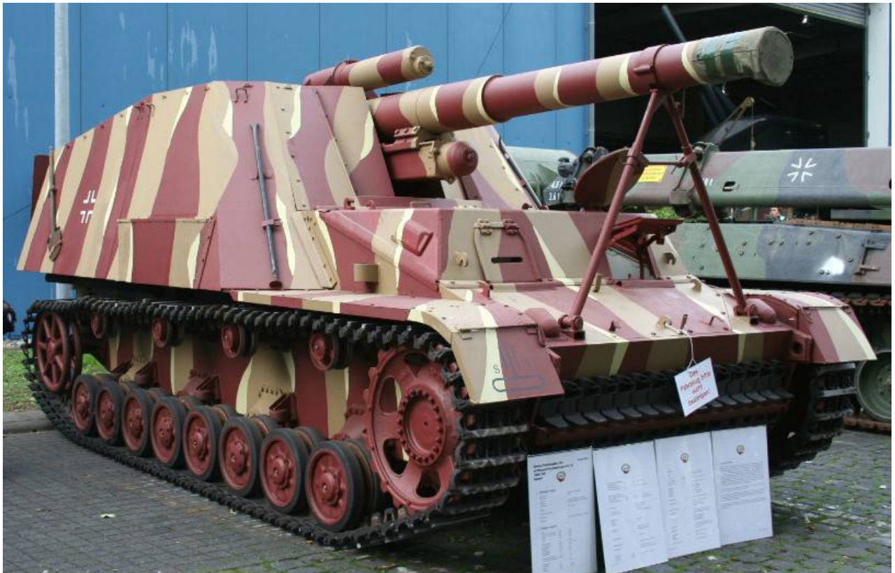
Klaus Nowak, September 2006 - http://www.rc-panzerketten-forum.com/wbb2/thread.php?threadid=7620

Fahrgestellnummer 320786 (Robby van Sambeek)