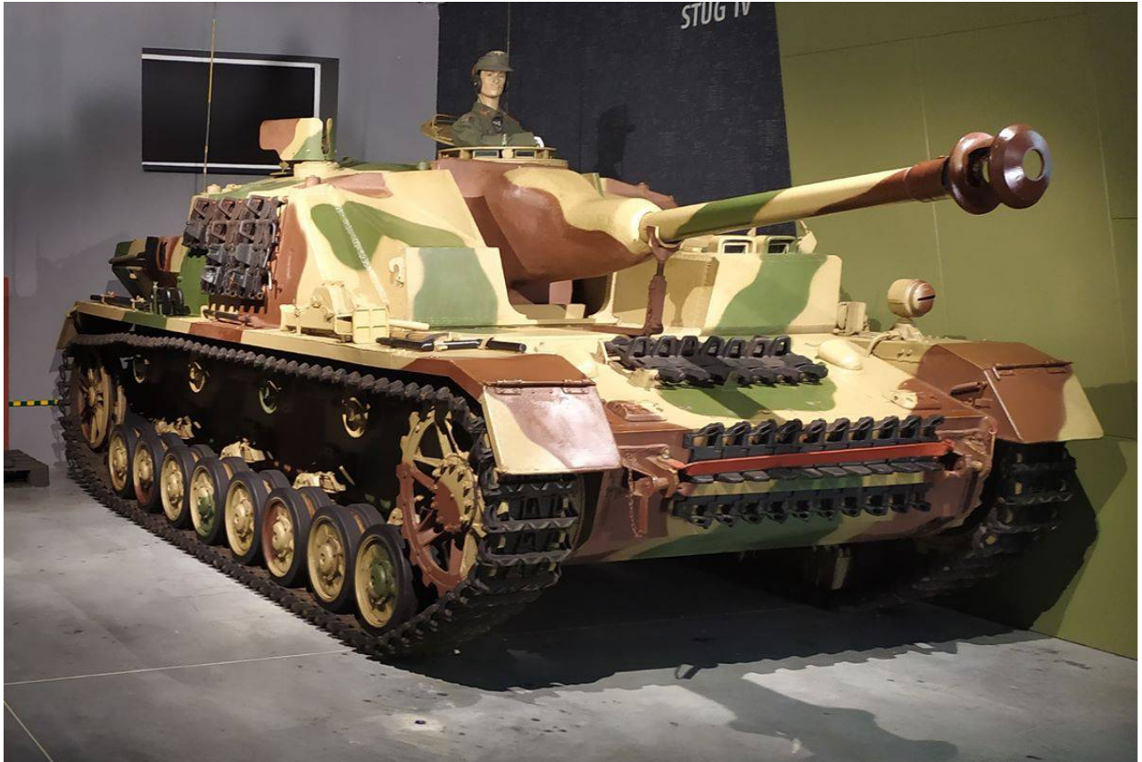
Photo from the museum, June 2020