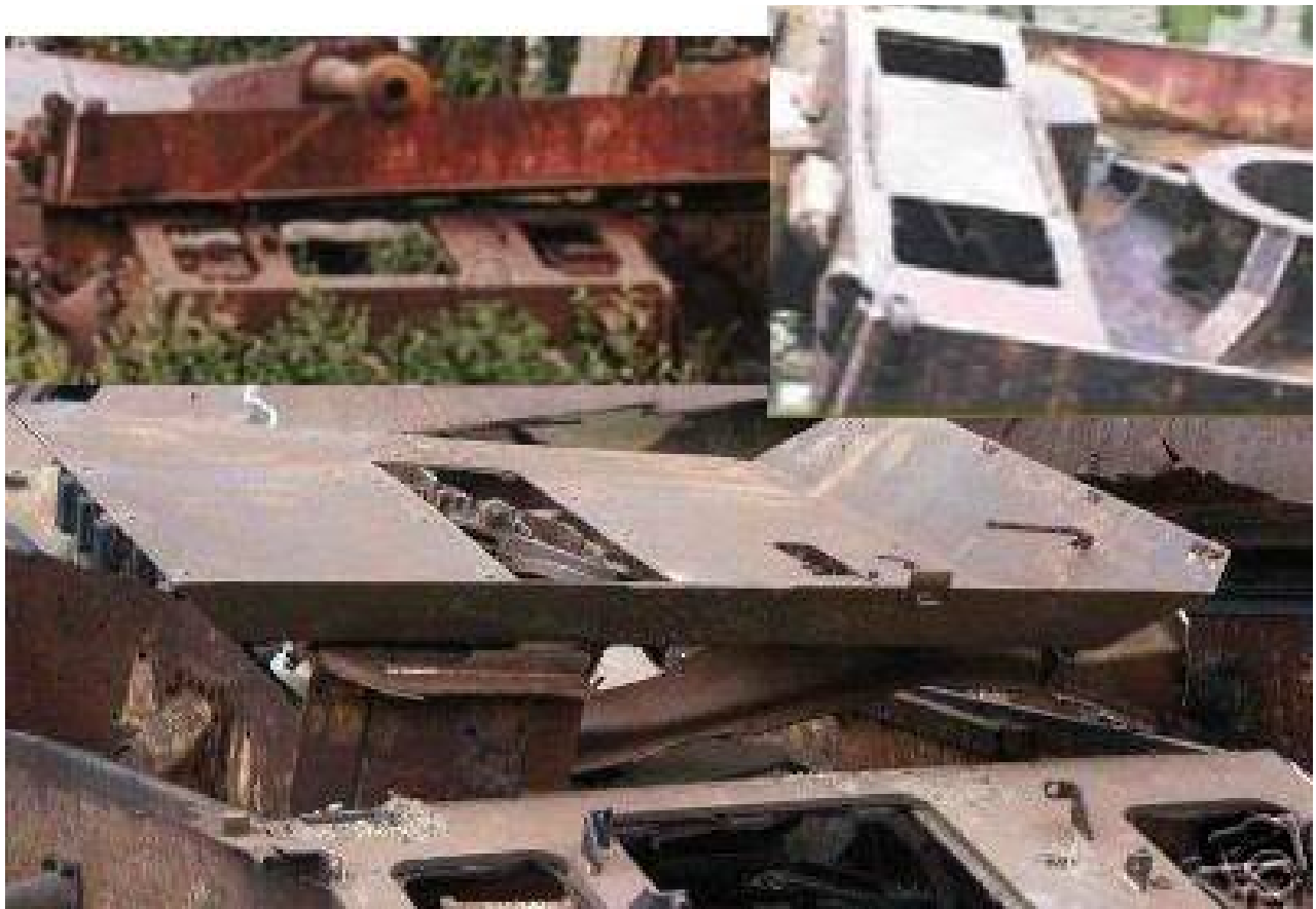
Flakpanzer IV Möbelwagen – Musée des Blindés, Saumur (France)

http://www.detektorweb.cz/prispevky/clanky/nalezty-techniky-ii-5119/