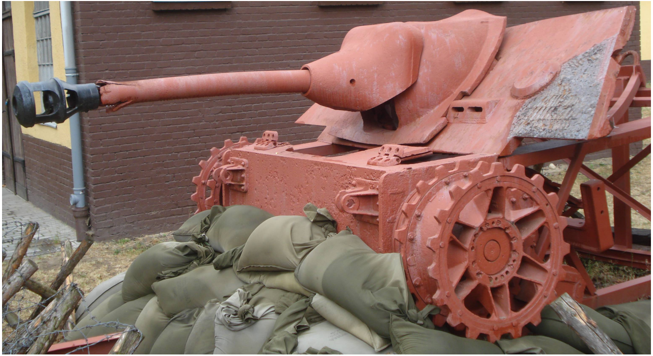
Maciej Boruń, June 2011