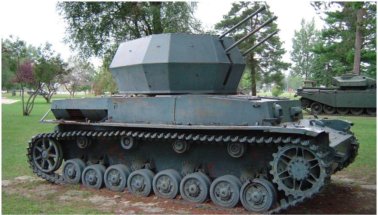
"Balcer", August 2005 - http://commons.wikimedia.org/wiki/Flakpanzer_IV?uselang=en