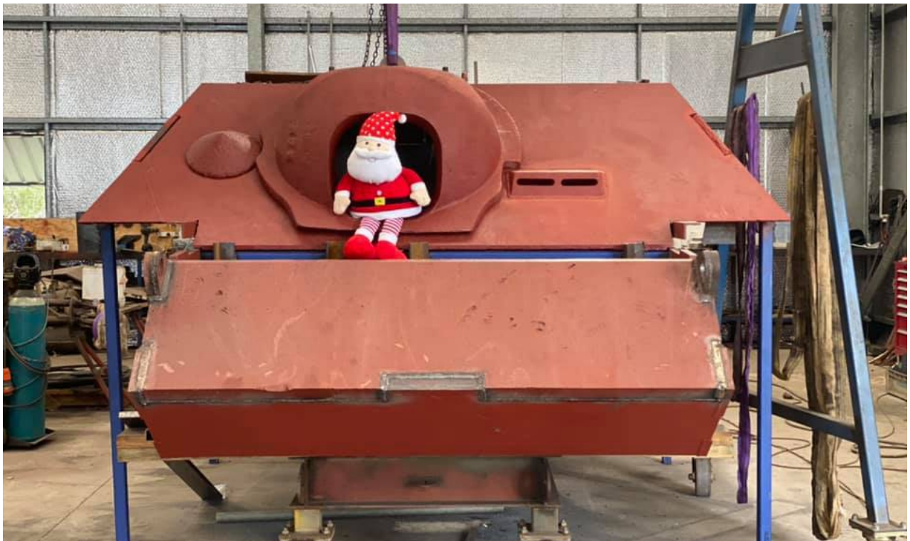
AAAM, December 2020

The front hull part was found in Krzewata, Poland (Piotr Lewandowski). The restoration process : http://warrelics.eu/forum/german-tanks-vehicles/554-something-pz-iv-chassis_july-2007-a.html